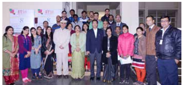
8th Seven Day National Workshop on Research Methodology on Management and Statistical Analysis Using IBM SPSS Statistics held from December 24-30, 2015.