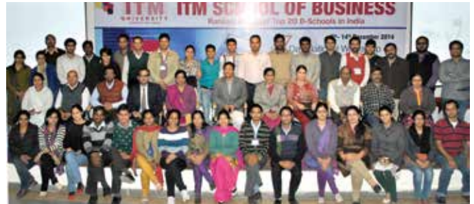
6th National Workshop on Research Methodology on Management and Statistical Analysis Using IBM SPSS 22.0 held from Decemebr 8- 14, 2014.