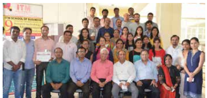
9th Seven Day National Workshop on Research Methodology on Management and Statistical Analysis Using IBM SPSS Statistics held from May 23-29, 2016.