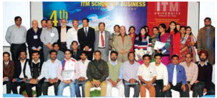
4th 7 Day National Workshop on Research Methodology and Management and Statistical Analysis Using IBM SPSS statistics 21.0 held from December 9-15, 2013.