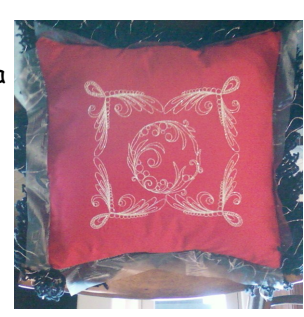
Machine Embroidery Users' Groups

Viking Designer Series Users' Group - 5/5/2011 - 10:00 AM to 12:00 PM - $10 or $80/year- Add fringe to your bobbin work pillow.