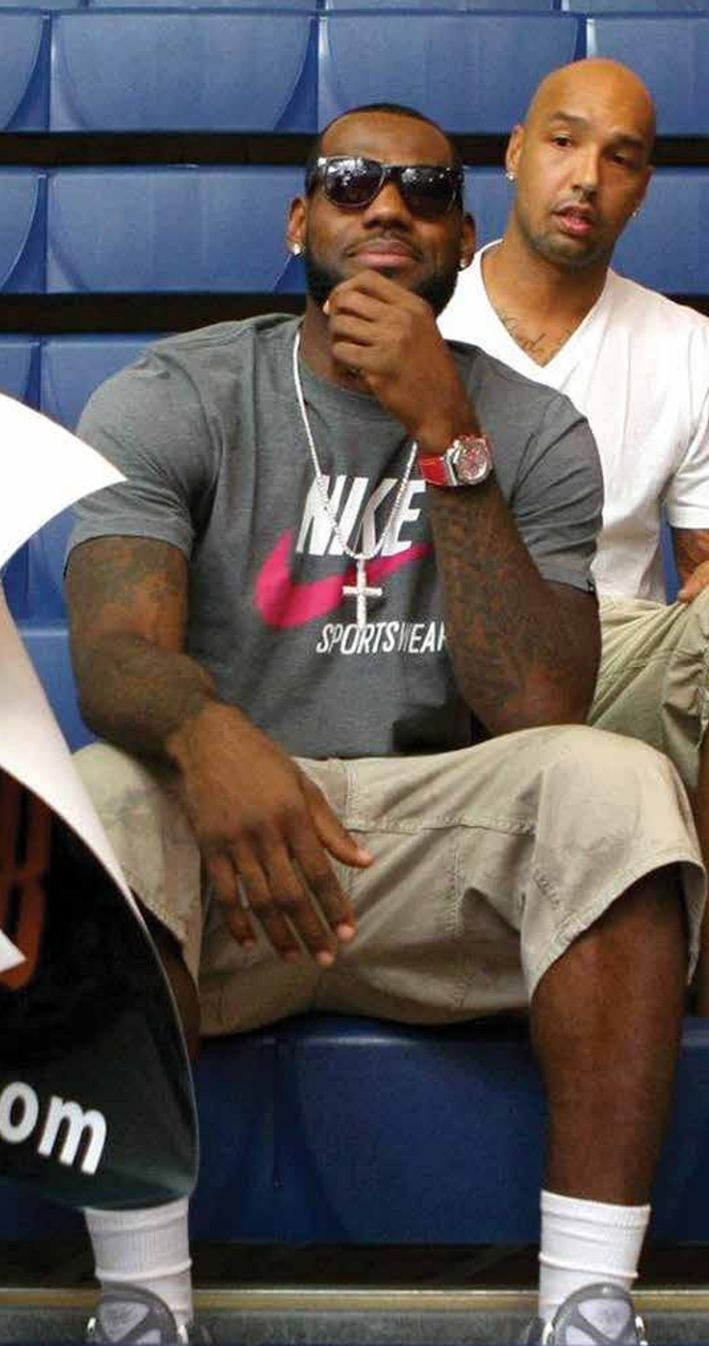
LeBron James with Drew Gooden watching 2010 Las Vegas Fab 48 Championship Game.

“Putting an event’s top 48 teams into a “super pool format,” with all games being played at one facility, has made it one of the summer’s most productive events, for both coaches and national scouts.”