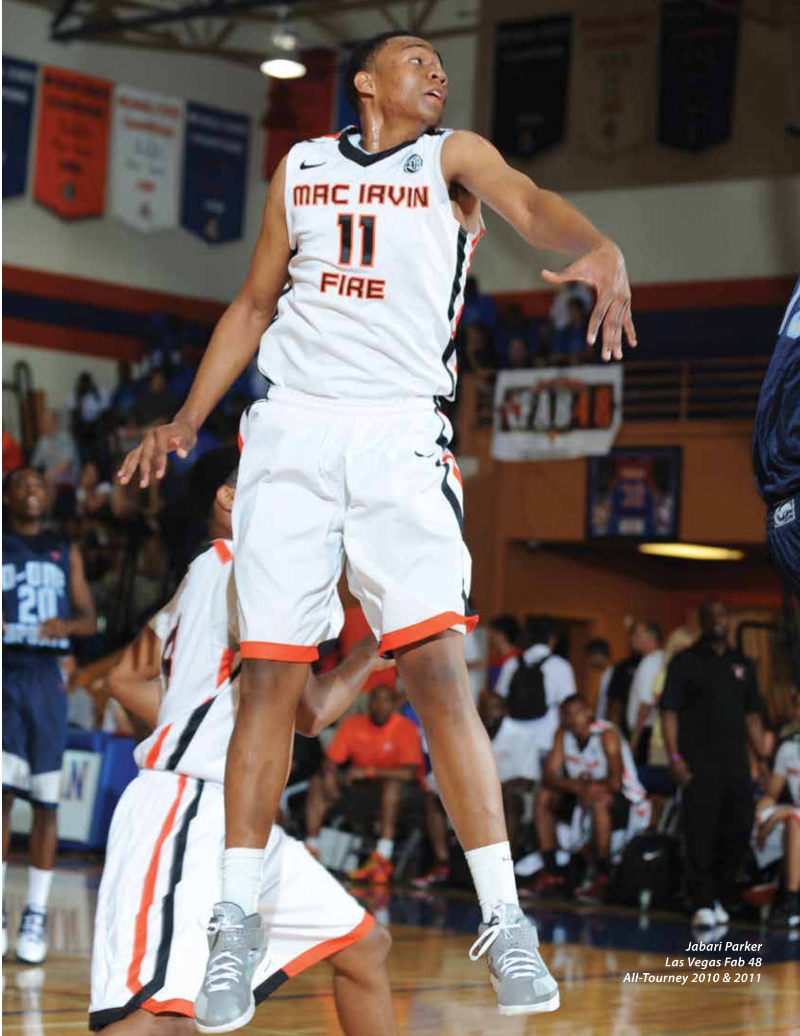
Jabari Parker Las Vegas Feb 48 All-Tourney 2010 & 2011