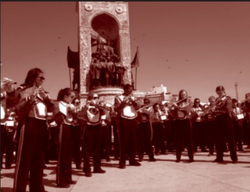
Shaker Band members at Istanbul's Taksim Square in March 2013

The Foundation also provided $136,343 in additional funds to support special projects such as master classes for voices and strings at the High School; assistance with expenses for students to participate in the band and orchestra trips to Turkey and China, respectively; and the purchase of a new scoreboard for the baseball team. For the MAC Scholars Program, the Foundation raised $5,000 from the Harry K. Fox and Emma R. Fox Foundation and $2,500 from Key Foundation. The Foundation also helped raise $30,000 from the Martha Holden Jennings Foundation to support implementation of the International Baccalaureate Middle Years Programme.