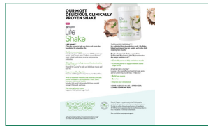
Life Shake Product Sheet