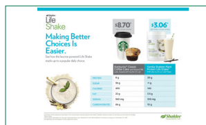
Meal Comparison Graphic