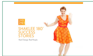
Shaklee 180 Success Stories