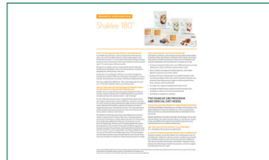
Shaklee 180 FAQs