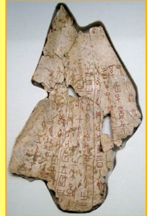
An example of an oracle bone

Around the year 200 BC, historians started to write down what they knew about the kings of the Shang Dynasty. They recorded their names and the order they reigned. More than 2,000 years later, oracle bones were discovered with writing on which described the kings and when they ruled. Some of the information was different to that in the history books so which evidence is correct?