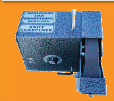
Train with the BEST and buy from the BEST !