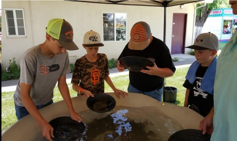
Taking a break from the Pig Barn and finding gold.