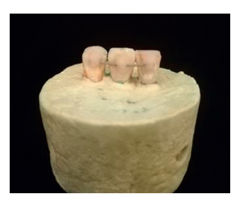
FIGURE 1: Mounting of the teeth in sets of three.