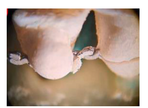
FIGURE 5: ARI score 3 fracture.

SBS data had normal distribution (P > 0.05), ANOVA was applied for general comparison of SBS of the groups. The Monte Carlo chi-square test was applied for the comparison of the frequency of ARI scores among the groups. The Kruskal–Wallis test was used for the comparison of the median ARI score. All statistical analyses were performed using SPSS version 18 (SPSS Inc., IL, USA) at 0.05 level of significance.