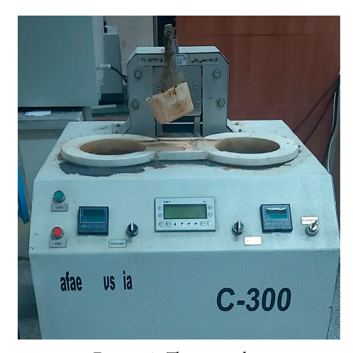
FIGURE 2: Thermocycler.

125,000 load cycles applied to the incisal edge of the incisor tooth positioned in the middle to simulate the masticatory forces applied to the teeth during a 6-month period in the clinical setting (Figure 3) [2]. Any fracture in the aging process was recorded.