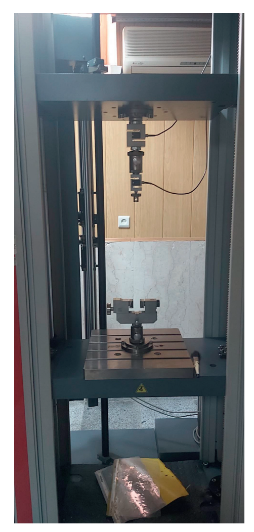
FIGURE 4: Universal testing machine.

Score 0: no adhesive remaining on the enamel surface Score 1: <50% adhesive remaining on the enamel surface