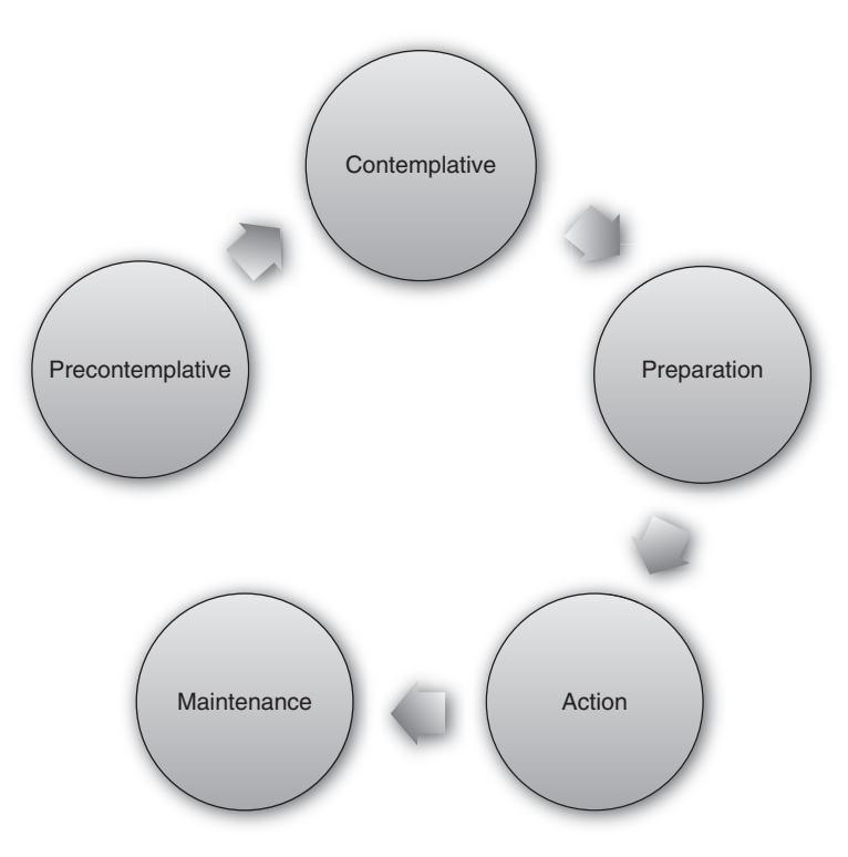
Figure 7.1 Stages of Change

rationalize their problems, minimize the consequences of their actions, or blame others.