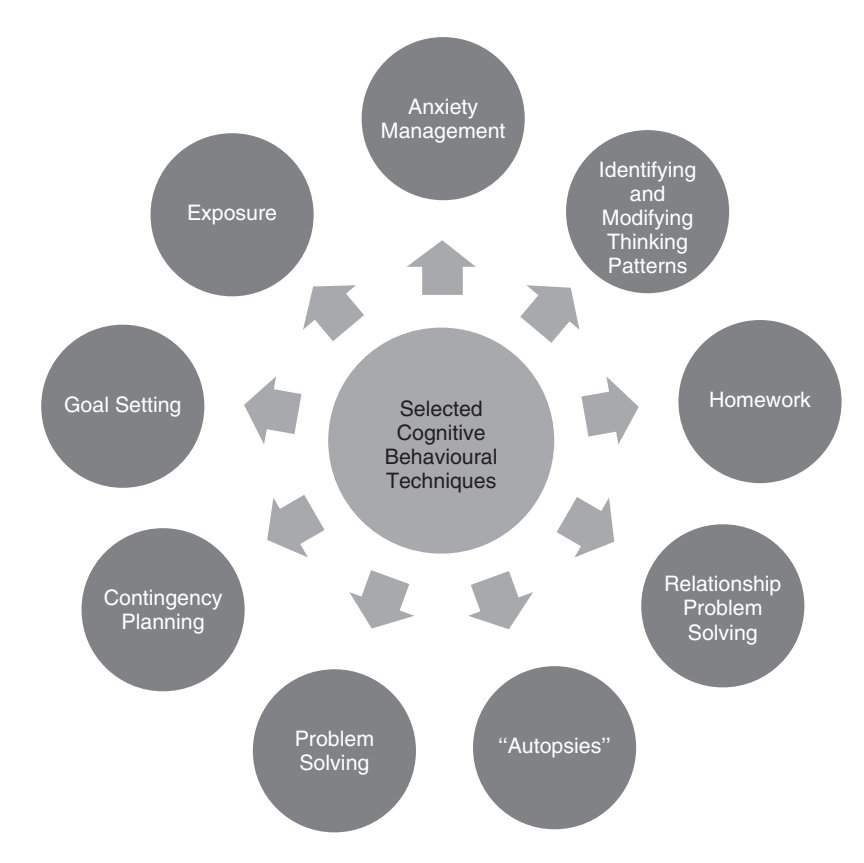
Figure 7.4 Selected Cognitive Behavioural Techniques