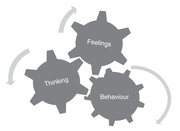
Figure 7.3 Interdependence of Feelings, Behaviour, and Thinking