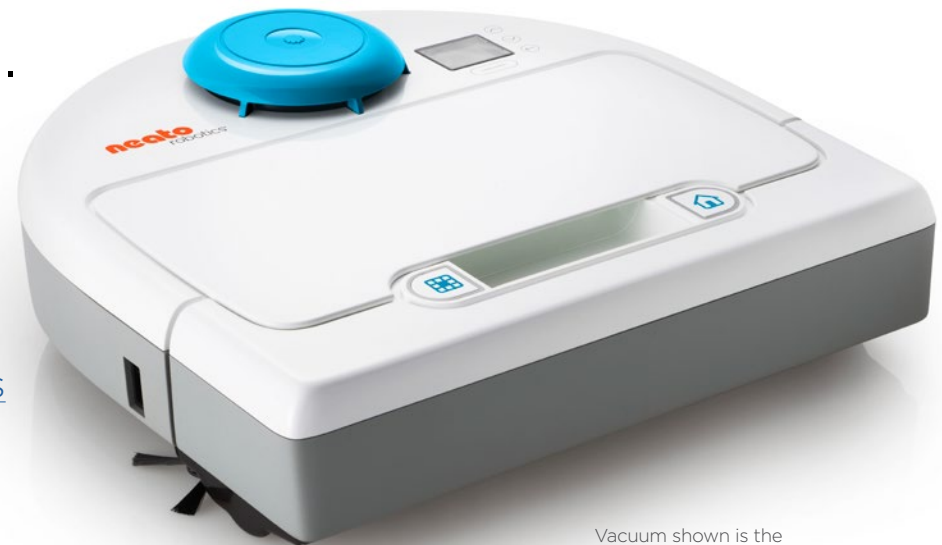
Vacuum shown is the Neato Botvac TM 85