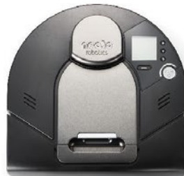
Neato Signature Pro™