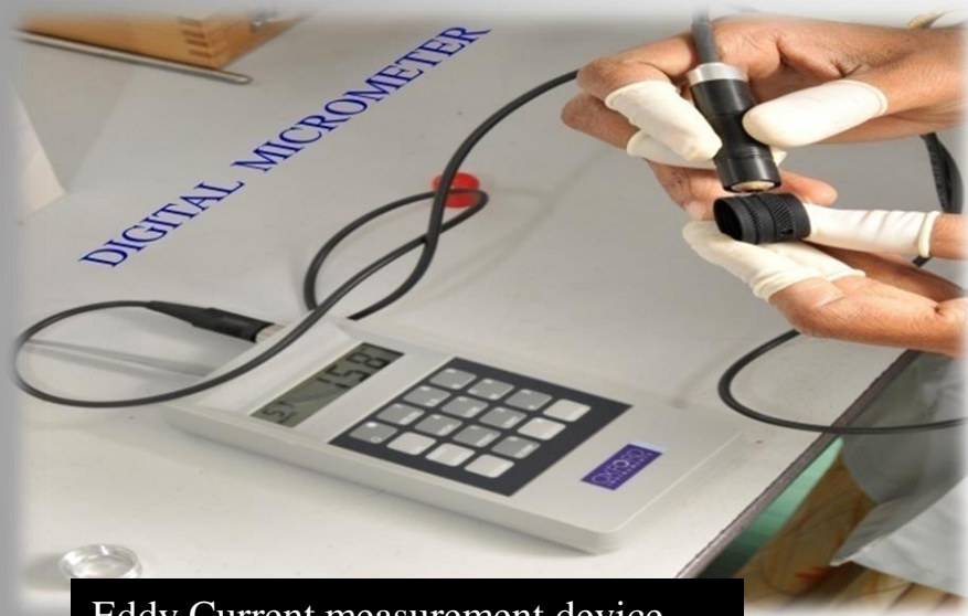
Eddy Current measurement device