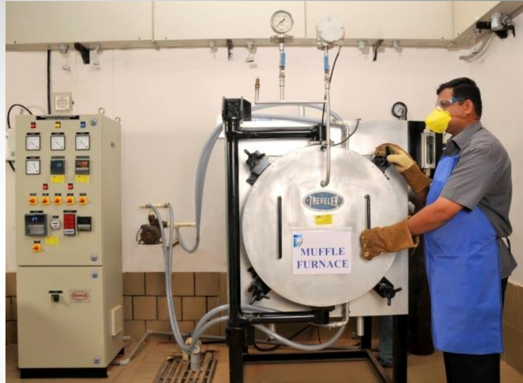
Muffled Furnace (High Baking) (Operating at inert atmosphere)