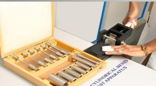
Adhesion Bend Testing (Metallic coating)