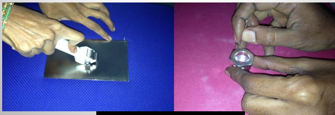
Adhesion Scratch and Chisel Testing.