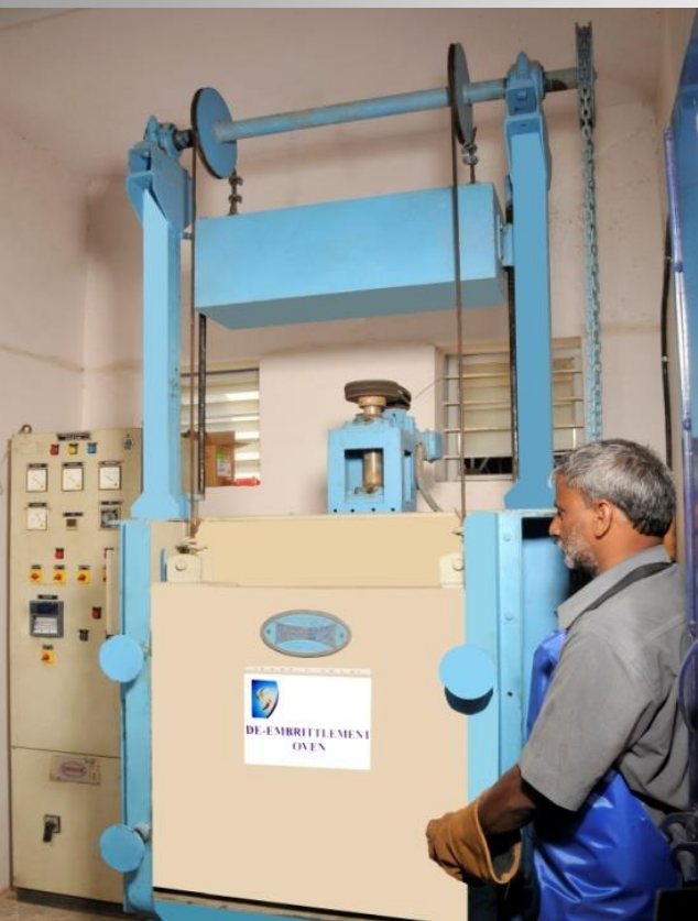
Hydrogen De-Embrittlement Oven & Heat Quench Test

Sheen is NADCAP accredited to perform the following Specimen testing.