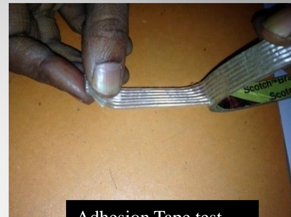
Adhesion Tape test