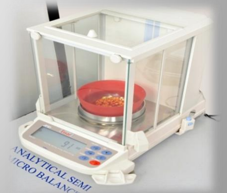
Coating Weight Testing