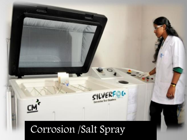
Corrosion /Salt Spray