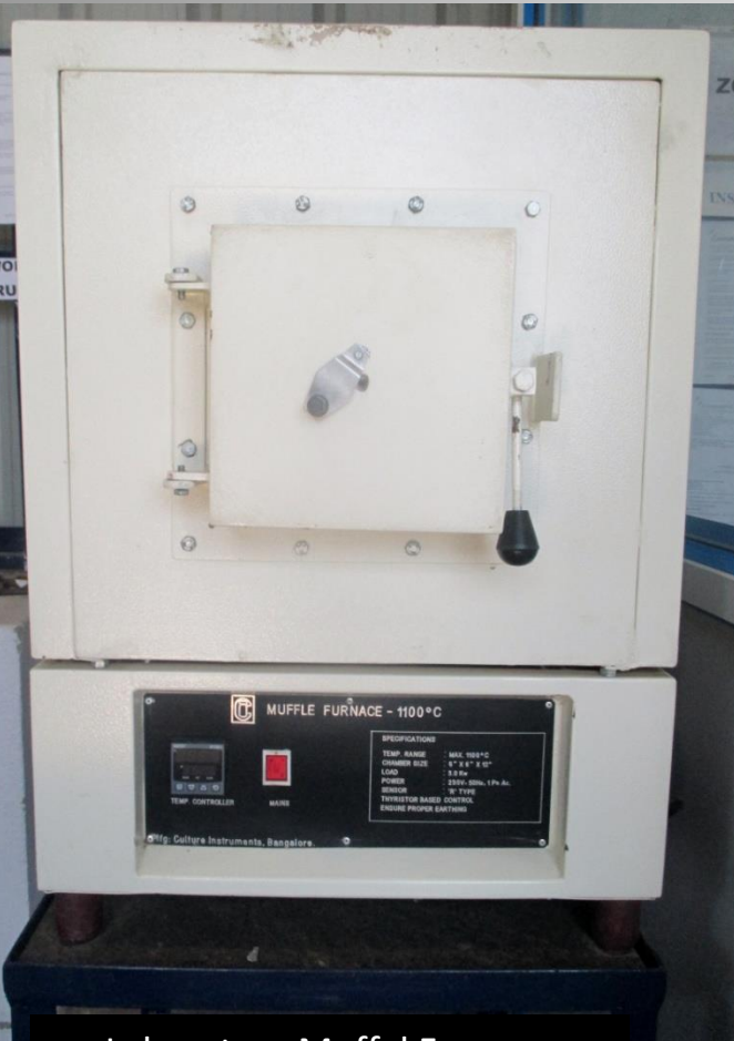
Laboratory Muffel Furnace (1100 °C)