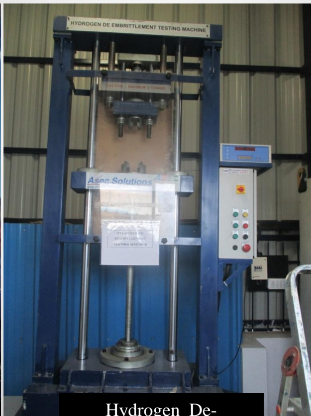
Hydrogen De-Embrittlement Testing Equipment (0-6 Tonne)