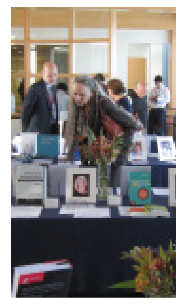
2012 Faculty Scholarship Celebration