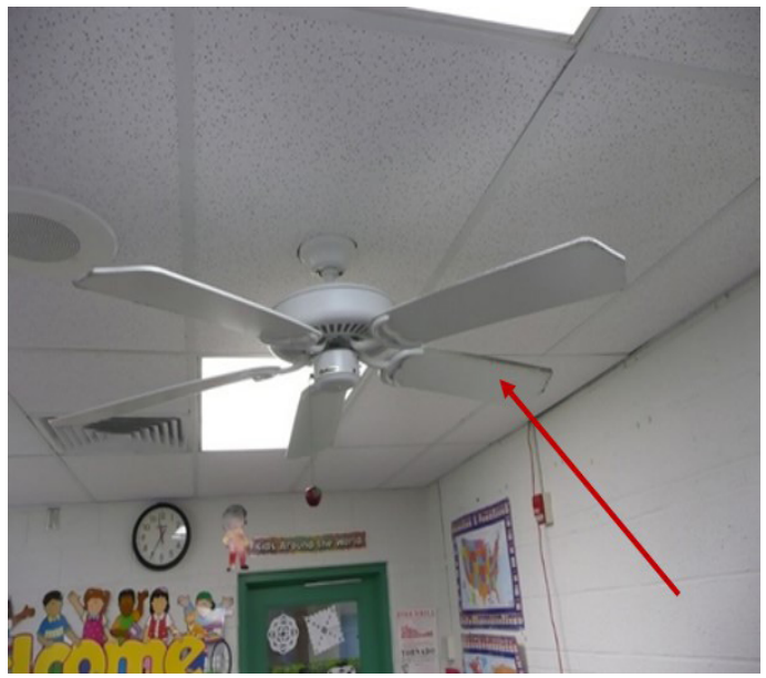
Figure A5. Dusty ceiling fan blades in classroom.