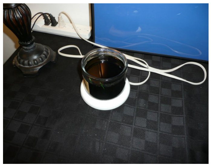
Figure A2. Electrically-heated scented candle warmer in classroom.