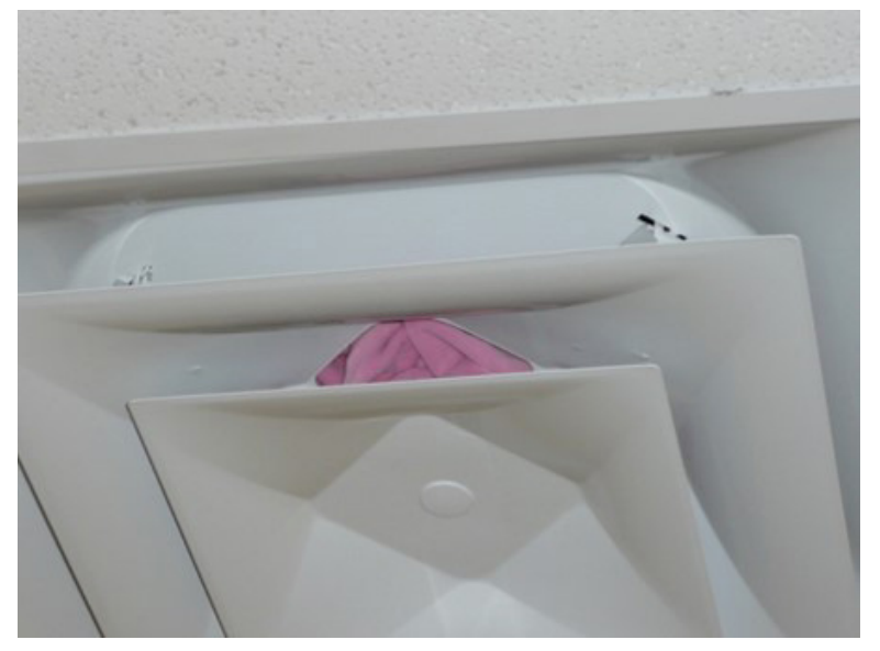
Figure A10. A blocked ceiling mounted diffuser in an office.