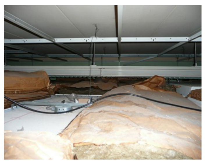
Figure A4. Dusty roll-faced insulation in plenum above classroom.