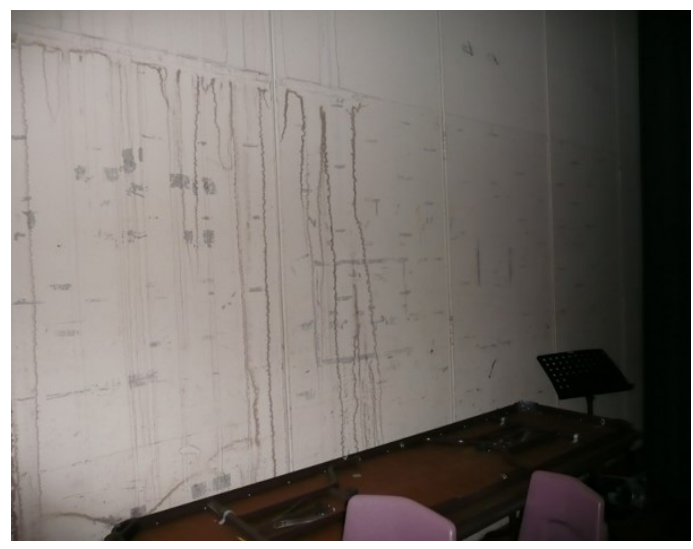
Figure A1. Old water stains on auditorium wall.