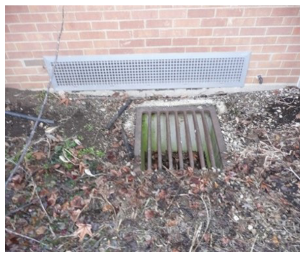
Figure A7. Debris in shallow dry well near outdoor air intake for classroom.