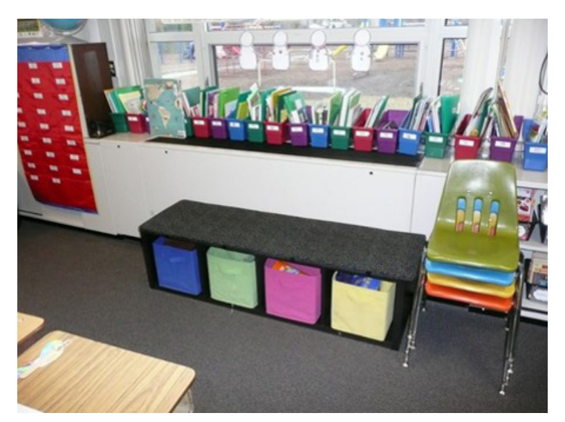
Figure A9. Storage cabinet (on floor) and teaching supplies (on top) blocking air intakes on a classroom unit ventilator.