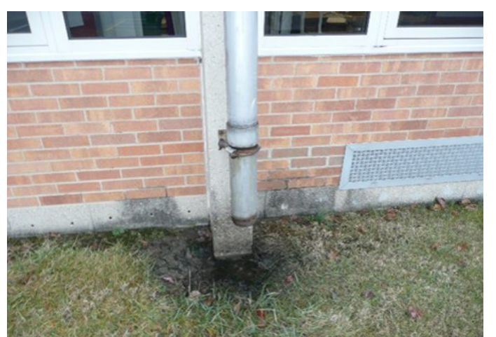
Figure A6. Broken and disconnected exterior roof drain outside classroom. Photo by NIOSH.

Figure A5. Dusty ceiling fan blades in classroom. Photo by NIOSH.