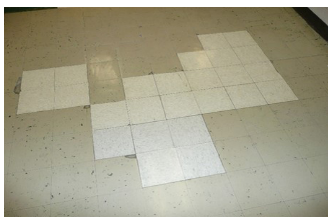
Figure A3. Chipped and cracked 9 inch by 9 inch floor tiles in school lunchroom.