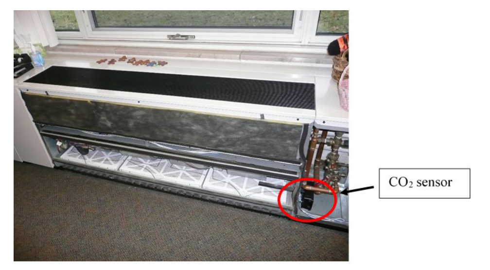
Figure A8. Interior of a typical classroom unit ventilator.