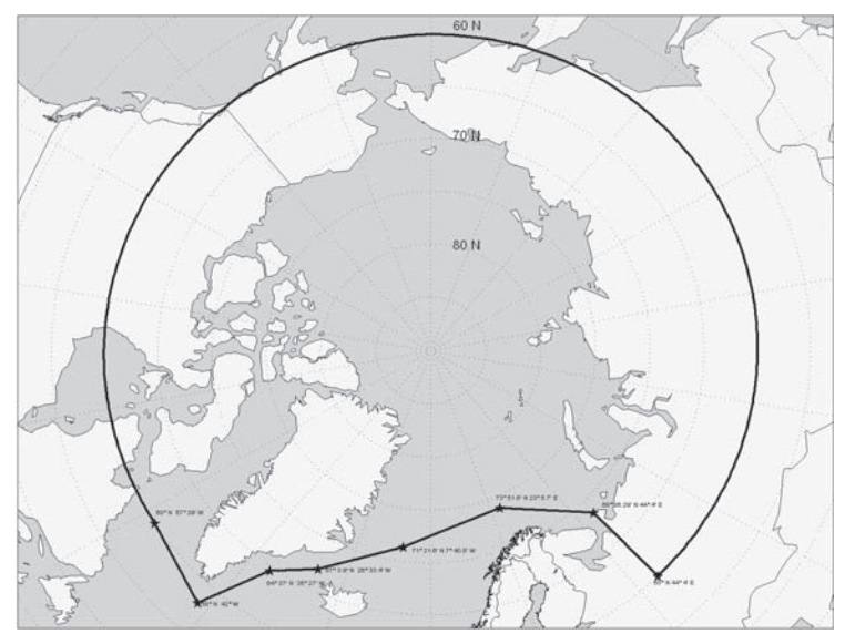
Figure 1 – Maximum extent of Arctic waters application (see paragraph G-3.3)*