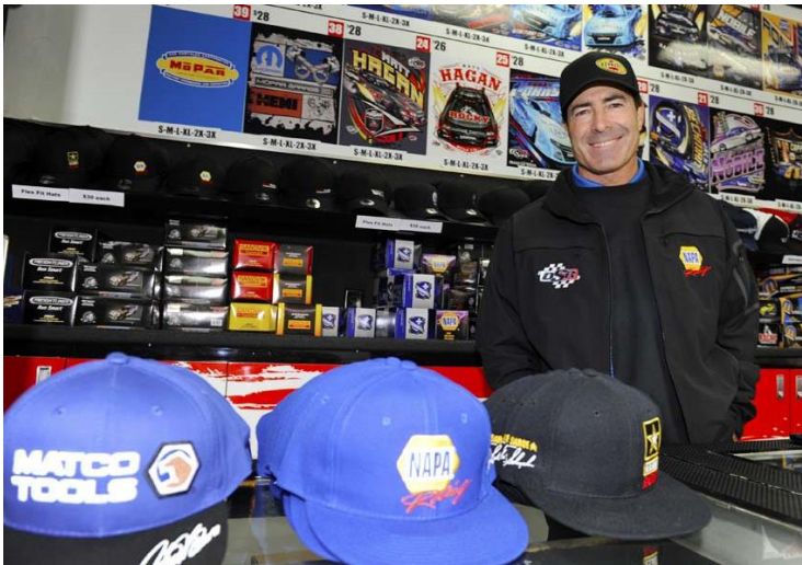
Ron Capps visits the DSR Merchandise trailer on the NHRA Midway during every race.

Visit Store.ShoeRacingStore.com for all current DSR merchandise.