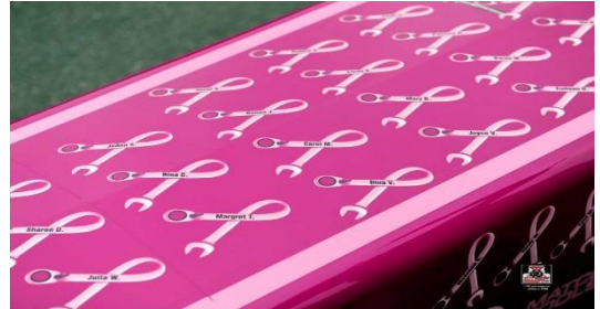
Antron Brown's Matco Tools' "Tools for the Cause" dragster will continue at Dallas and Las Vegas to carry 262 names of those affected by breast cancer submitted by Matco Tools distributors, employees and field personnel.