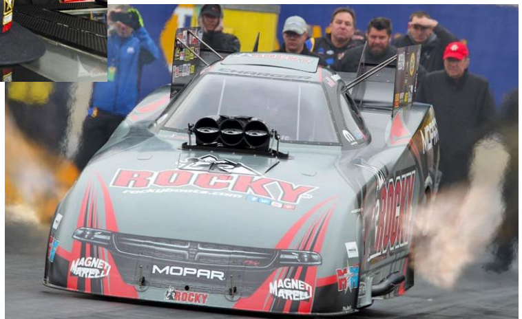
Matt Hagan and the Rocky Boots/Mopar Dodge Charger R/T moved to within 90 points of the championship points lead at Maple Grove Raceway in their quest to defend the world title.

Visit Store.ShoeRacingStore.com for all current DSR merchandise.