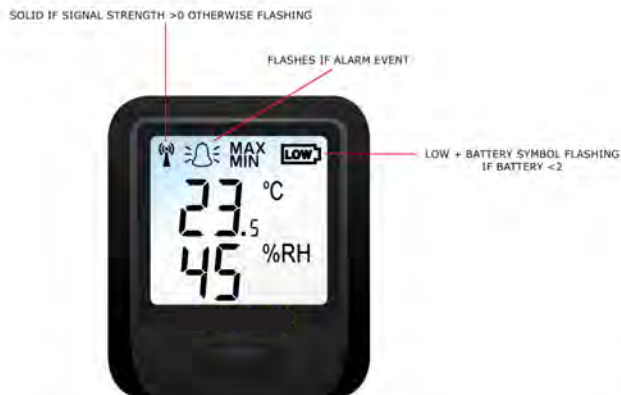
1) NORMAL DISPLAY - CURRENT TEMPERATURE