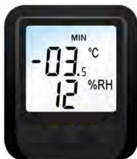
3) MINIMUM RECORDED VALUES SINCE LAST RESET