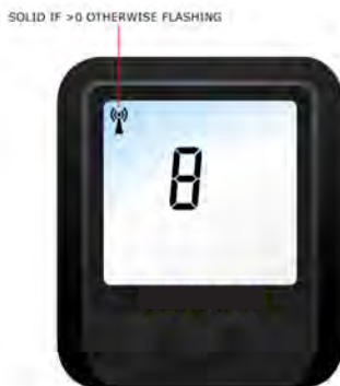
4) RECEIVED SIGNAL STRENGTH INDICATOR (RSSI) (VALUE BETWEEN 0 & 10)