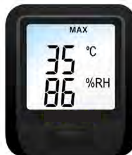
2) MAXIMUM RECORDED VALUES SINCE LAST RESET