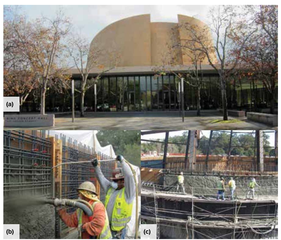
Shotcrete is ideal for placing complex structures: (a) the curved enclosure wall of Stanford University's Bing Concert Hall comprises shotcrete with a sand float finish; (b) a certified nozzle operator and a blowpipe operator construct mockup panels for the enclosure wall; and (c) crews placed the 12 in. (300 mm) thick enclosure wall in multiple lifts, using a removable screed rail to control the thickness