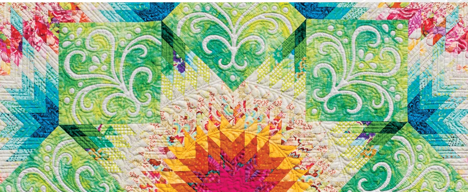
Detail: PARADISE OF FLOWERS AND FOUNTAINS by Naomi Ootomo