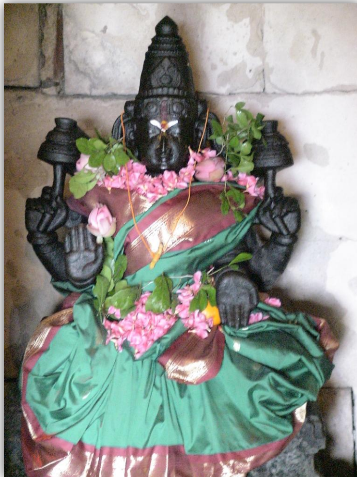
Sundara Maha Lakshmi - The Supreme Goddess of Wealth