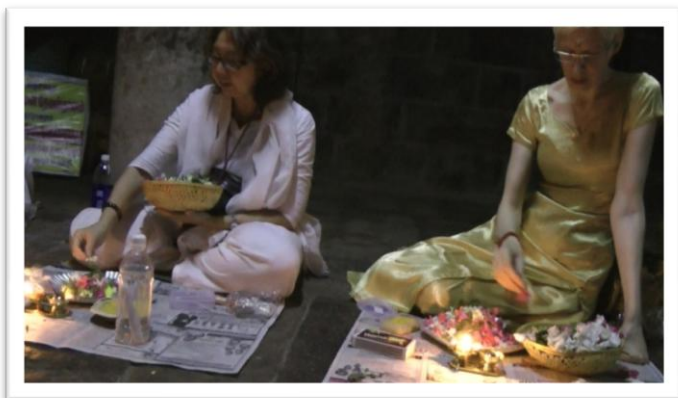
Performing our own private pooja in a temple's sanctum sanctorium during the Grace Light Powerspot Trip last month