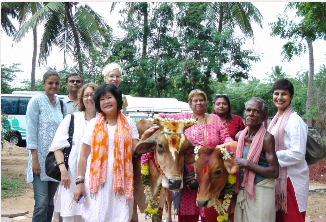
Performing a rare COW POOJA during the Grace Light Trip. The cow is the sacred embodiment of Goddess Lakshmi & abundance