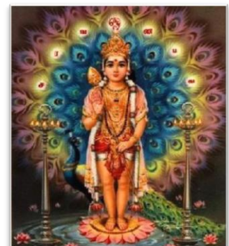
Muruga as a Boy

Muruga is usually depicted with a Vel , a kind of lance or spear, in his hand. The Vel is a powerful weapon to destroy negativity and bad karma. Concentrating on the Vel will give you divine intelligence. The Vel is both an