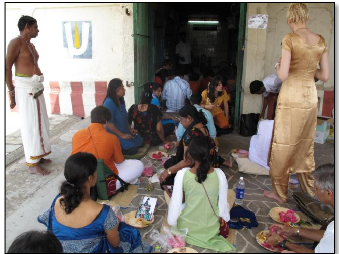
Chanting of Lakshmi's wealth mantra and puja at Goddess Lakshmi's powerspots