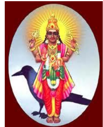
Lord Saturn pictured here with His vehicle, the Crow

At Thirunaraiyoor , we have engaged the temple priest to perform Sahasranama archana (calling His 1008 names glorifying Him) thereby showering you with Saturn's blessings.