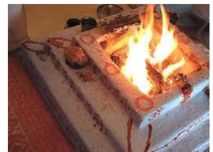
A homa (fire ritual) is the fastest way to attract wealth and abundance to yourself