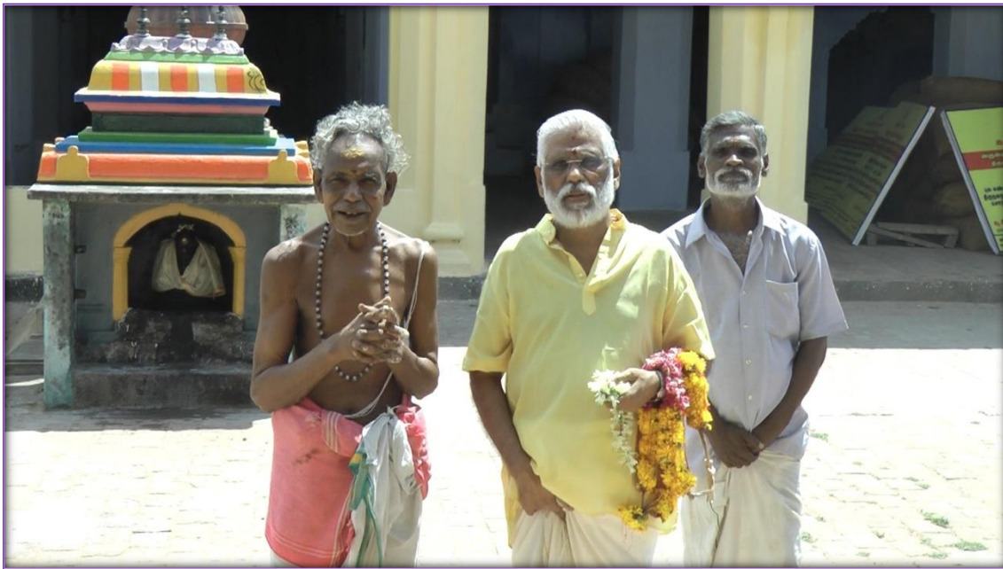
Babaji at Goddess Lakshmi's Birthplace (2012)

We will be chanting SHREEM BRZEE on-site while performing our own offerings to Goddess Lakshmi.