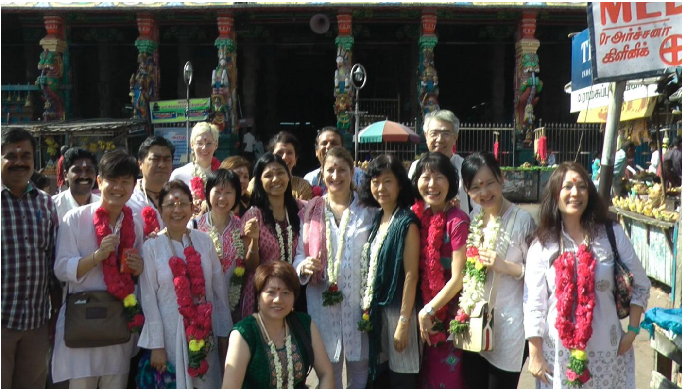
6 Secrets of Muruga Powerspot Trip (February 2012)

Earlier efforts to sell her apartment had been unsuccessful, but after working with SHREEM BRZEE things dramatically changed.