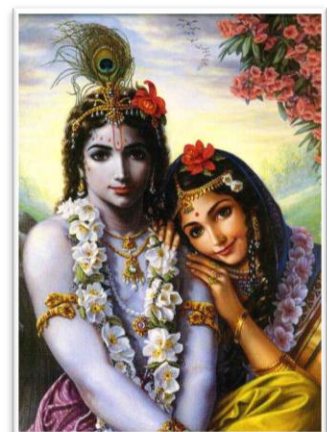
The Divine Couple - Radha & Krishna