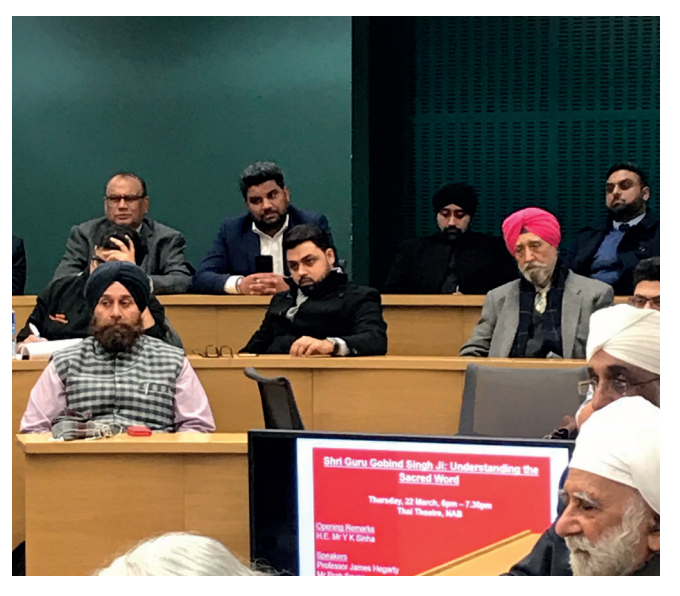
MEMBERS OF THE AUDIENCE AT 'SHRI GURU GOBIND SINGHJI: UNDERSTANDING THE SACRED WORD' ON 22 MARCH 2018, LONDON SCHOOL OF ECONOMICS, LONDON.