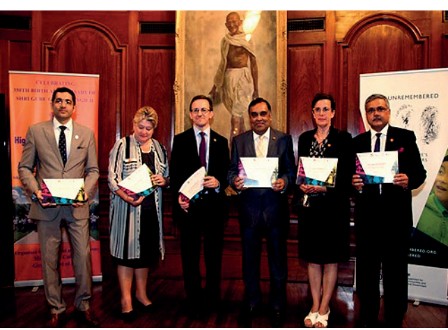
ABOVE: LAUNCH OF THE RESOURCE PACK ON 'INDIA UNREMEMBERED: CONTRIBUTION OF SIKHS IN INDIAN LABOUR CORPS, WORLD WAR I' AT INDIA HOUSE, 14 JUNE 2017, LONDON.

LEFT: PRACTICITIONERS OF GATKA, A PUNJABI MARTIAL ARTS AT A COMPETITION PART OF THE BAISAKHI CELEBRATIONS ON 30 APRIL 2017, LONDON.