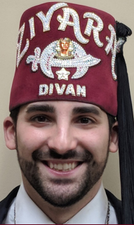
Captain of the Guard