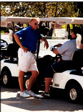
2011 SIDS Scramble