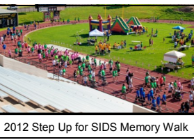
2012 Step Up for SIDS Memory Walk