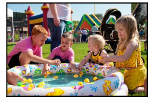
2012 Step Up for SIDS Children's