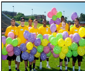
Bethel College Basketball Team