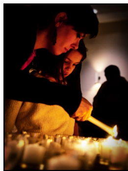
2011 Candle Lighting Memorial