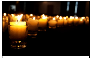
2011 Candle Lighting Memorial