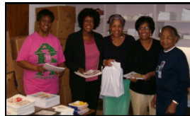
Thanks to Alpha Kappa Alpha Sorority, Inc. over 33,000 Six Steps to Safety packets have been assembled and distributed to new and expectant parents.