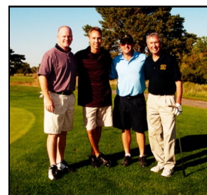
2011 SIDS Scramble