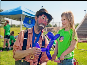
2012 Step Up for SIDS Children's Fair