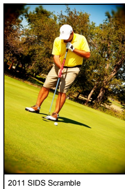
2011 SIDS Scramble