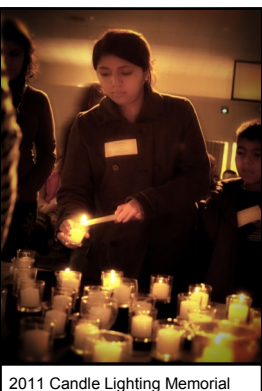
2011 Candle Lighting Memorial