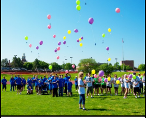
Annual Memorial Balloon release at Step Up for SIDS