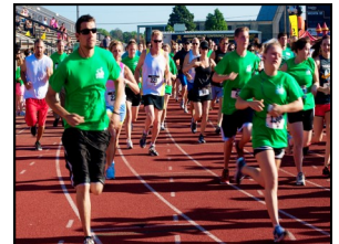
2012 Step Up for SIDS 5K