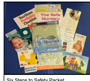
Six Steps to Safety Packet