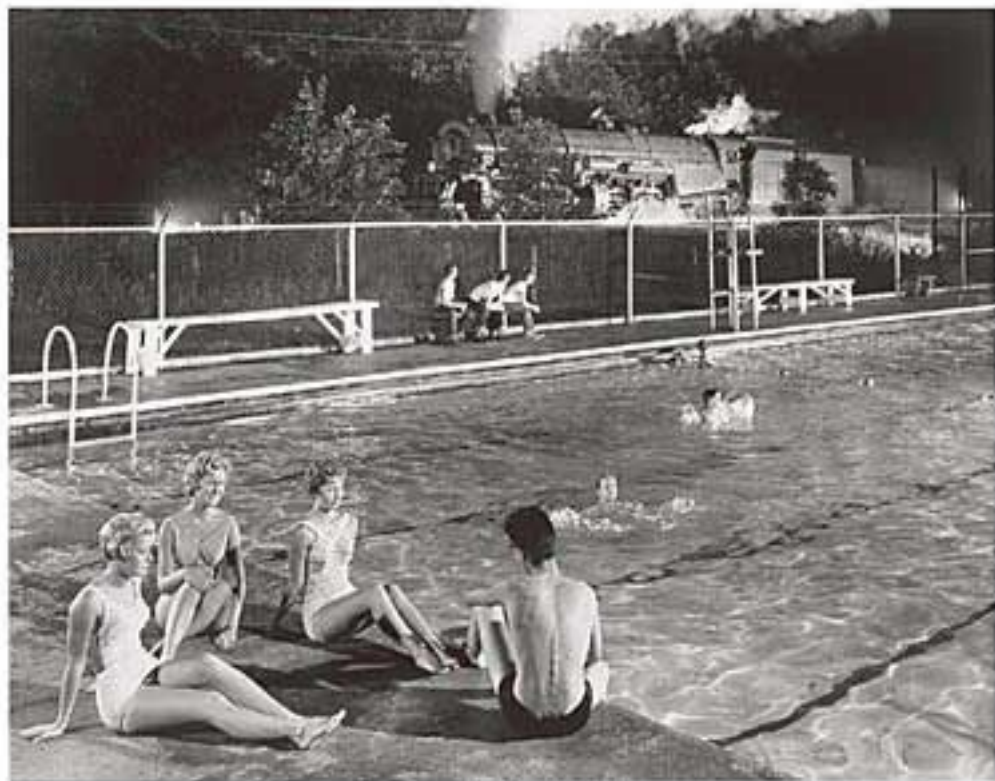
O. WINSTON LINK / RAILROAD PHOTOGRAPHS OF THE 1950'S