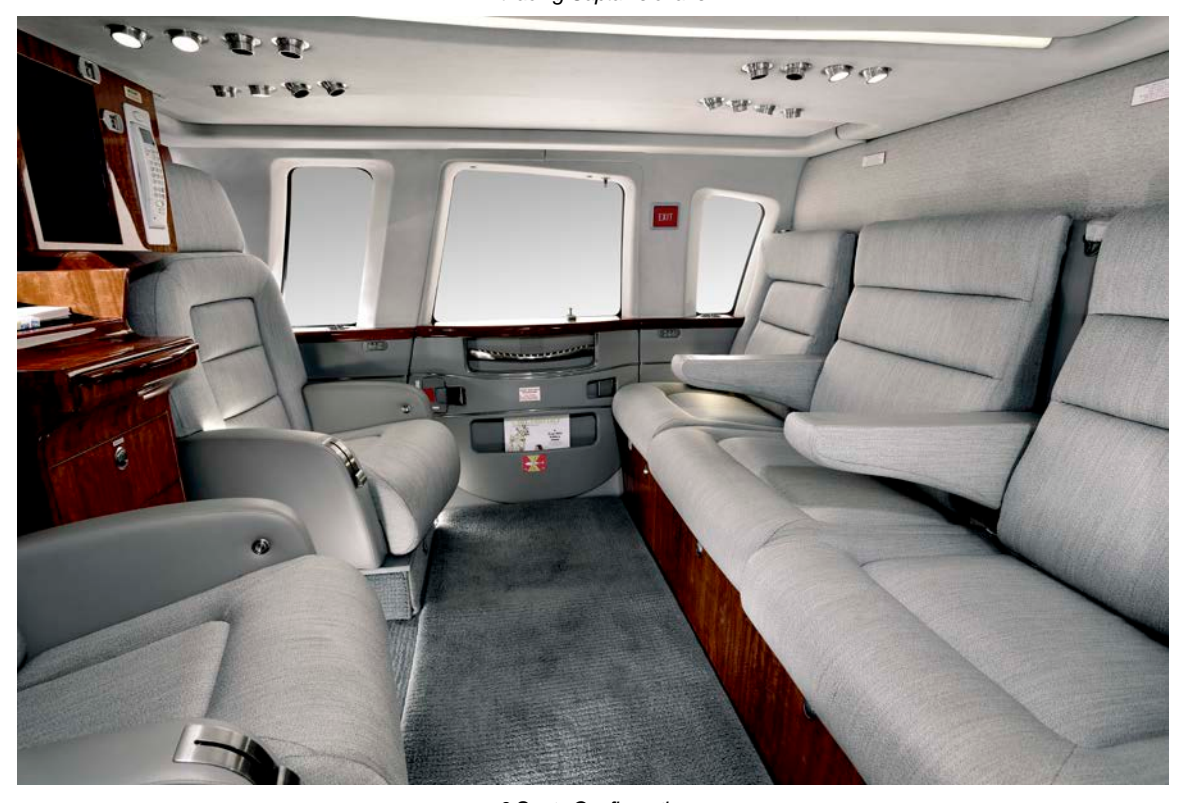
6 Seats Configuration