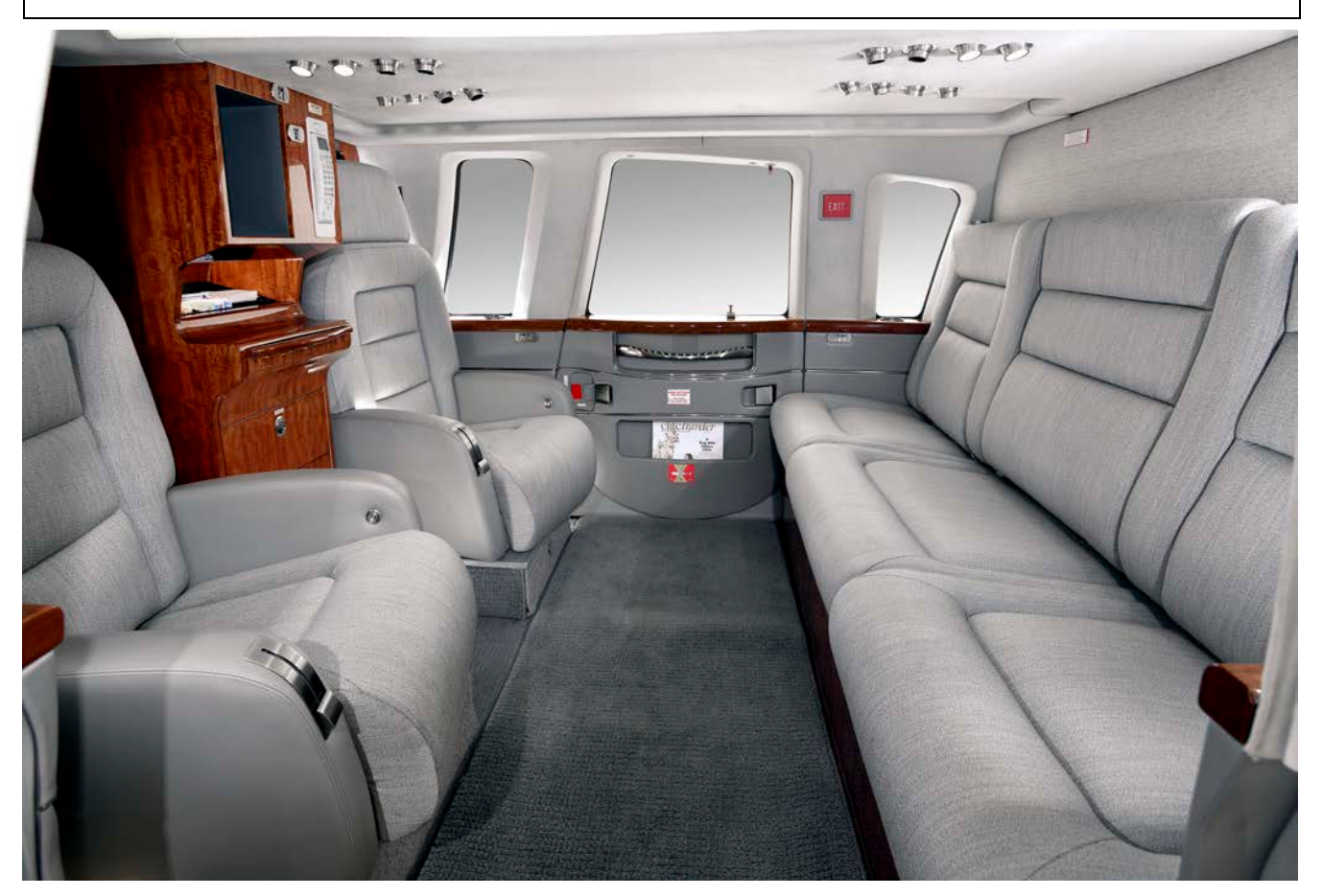
6 Seats Configuration

Executive 6 passenger configuration features a forward refreshment center cabinet between two Captains swivel chairs facing aft and 3/4 seat aft divan w/ fold down armrests.