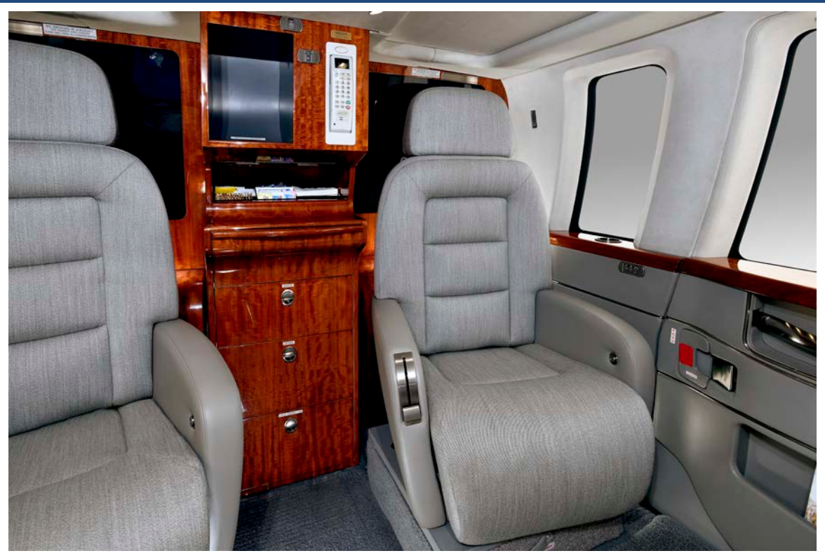
Aft facing Captains chairs