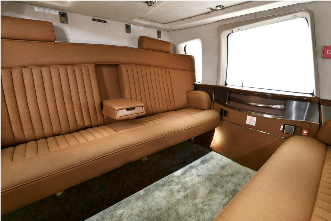
Seats Facing Forward