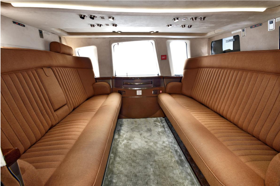
8 Seat Configuration

401 INDUSTRIAL AVE. TETERBORO, NJ 07608 - GEORGE@JETASG.COM - (201) 906-1411