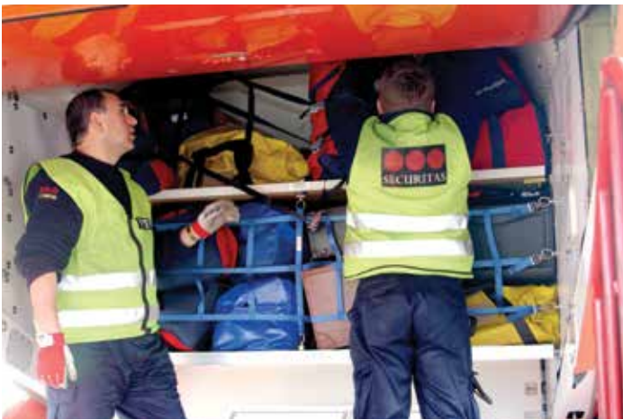
The rear ramp allows easy access to the large cargo area, which offers ample storage for baggage and supplies (bottom).

In addition to more space, the S-92 helicopter provides a more comfortable atmosphere for long flights. Separate heating and vent systems provide passengers with fresh air from overhead while at the same time keeping their feet warm. For better air quality the entire cabin air volume is replaced once a minute. The vibration control systems and cabin acoustic enhancements yield a smooth ride and quiet cabin.