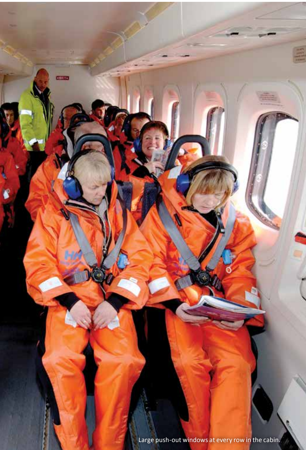
Large push-out windows at every row in the cabin.