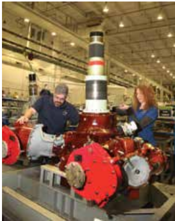
Providing global support regionally through Sikorsky-authorized service centers

Our support begins even before you purchase your Sikorsky aircraft. We engage with your team, understand your business needs and help you choose the appropriate aircraft and provisioning based on your mission. Our comprehensive service offering include: