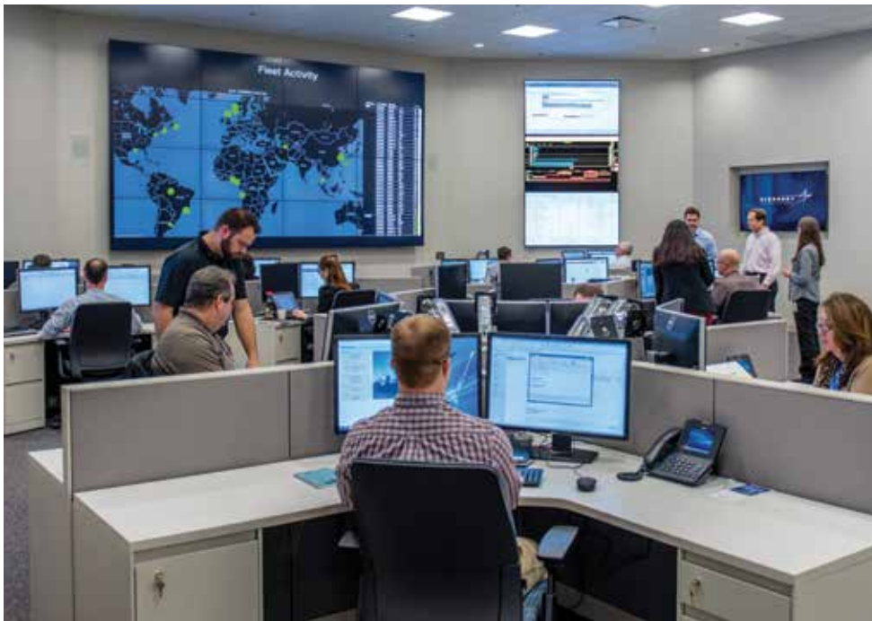
State-of-the-Art Customer Care Center is open 24/7/365 to support your aircraft from Fleet Management to AOG Resolution