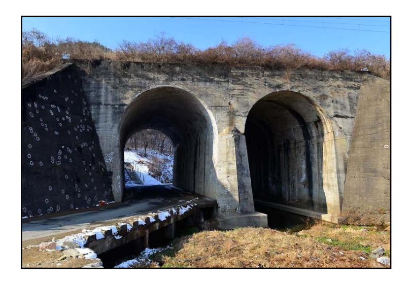
Figure 1. The twin tunnels at Nogunri, Yongdong County, North Ch'ungch'ong Province.

fleeing civilians by the twin tunnels that fateful day in 1950—are neatly displayed. The initial sense of isolation, emptiness, and unease one feels when encountering the park befits a memorial dedicated to an event that still remains largely marginalized in Korean history.