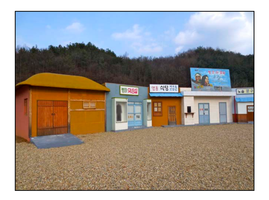
Figure 7. "Memory-Stirring Living Gallery," Nogunri Peace Park.

translucent, like ghosts haunting the tunnel; the sound of machine guns and bombs reverberate from within the passageway. In Korean only, a didactic message hangs at the entrance: "Experience the fear of those who perished in the twin tunnels."