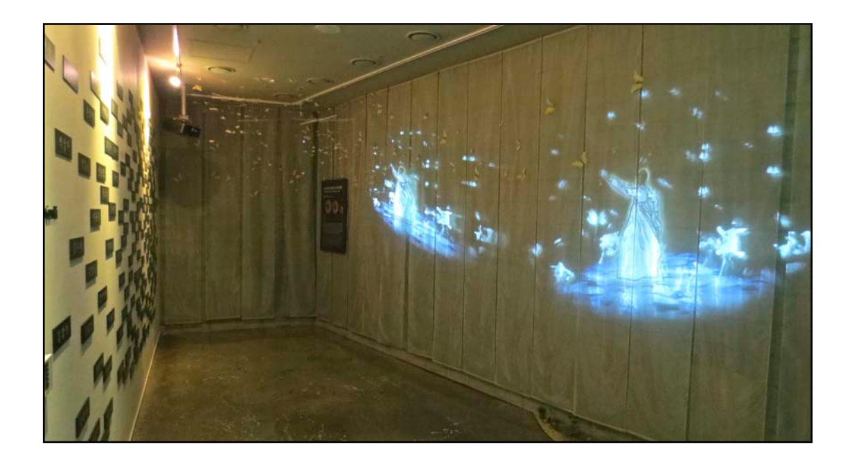
Figure 5. "Mortified Souls: In Memory of Nogunri," Nogunri Peace Memorial.

To be fair, the dead are not entirely absent from the memorial and park. In a small foyer leading to the upper level, under the heading "Mortified Souls: In Memory of Nogunri," small wooden plaques are inscribed with the names of those who were killed in the Nogunri Massacre (figure 5). Outside, beyond the towering commemorative monument, a steep fifteen-minute trek up the hill, is the Nogunri Incident Victim Cemetery (figure 6). Twenty-eight graves are marked by tombstones; the majority of the victims, whose bodies were shattered beyond identification, are laid to rest in three collective tombs. While the cemetery is noted on the Nogunri Peace Park brochure (it is listed as number 18, after the Facility Maintenance Office), it is hidden behind the rolling hills. Much like the touch-screen monitors, it requires initiative on the visitor's part to visit the cemetery.