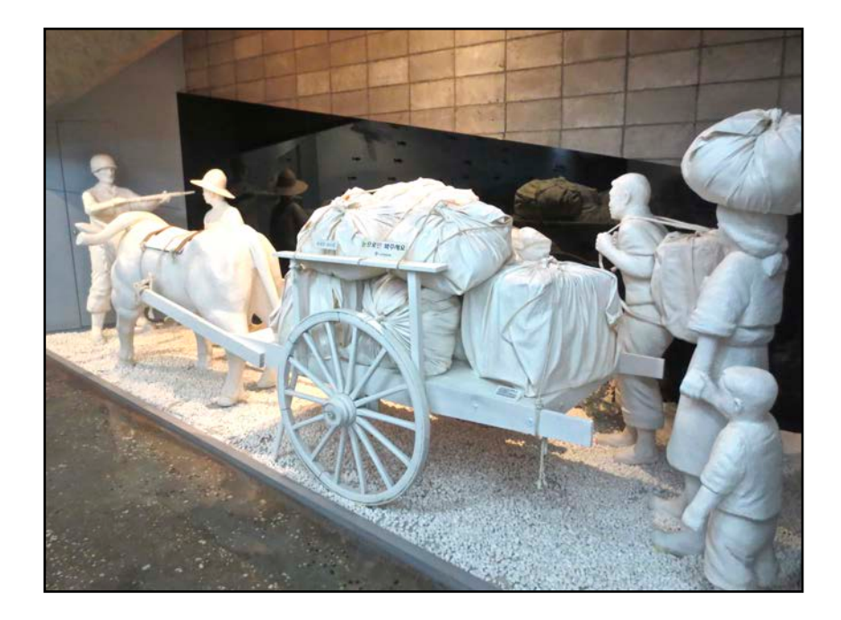
Figure 3. "Dragged Footsteps" sculpture, Nogunri Peace Memorial.

Downstairs, a life-sized white plaster sculpture titled "Dragged Footsteps" reproduces the familiar image of Korean War refugees: an ox-drawn cart, adults carrying bundles, mothers with their children (figure 3). In the front, a soldier blocks the refugees' footsteps with an M4 carbine. The whiteness of the plaster and the vacant expressions of the figures produce an eerie feeling. Across from "Dragged Footsteps" is a heavy metallic composition suitably titled "Tragic Memories of 1950's Summer: Road," in which two pairs of graphite military boots march along two parallel lines of skulls, shrapnel, bullet shells, and barbed wire (figure 4).