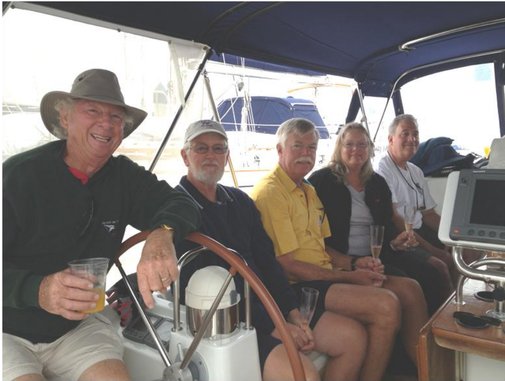
Mimosas were appropriately served aboard Champagne on Sunday morning before heading up to the hotel for its famous brunch!