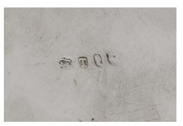
An early 19th century Chinese Export silver teapot stand, Canton circa 1820 mark of Tu Hopp Of circular form with cavetto edge and ovolo rim, raised upon three fluted lion paw bracket feet. Plain field. Marked to the reverse with pseudo hallmarks (lion passant, Duty mark, Leopards head) and a T. Diameter – 18.6 cm / 7.4 inches Weight – 252 grams / 8.1 ozt

Tu Hopp whose mark of a T which was previously unidentified (Crosby 1975) is listed by Kernan (1985) as "a rare maker who probably used the letter T as his mark. He is known from the ships's manifest to have made a tea chest that was imported on the second voyage of the Empress of China in 1786. This puts him along the earliest known makers for the American market and, of course, in Canton.". There is also a suggestion that Tu Hopp supplied wares that were intended for the continental market, a large set of gilt fruit knives and fork marked with Tu Hopp's T only in the French empire style were sold these rooms, 23rd Oct 2019, Lot 109.