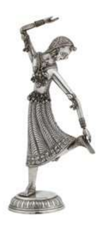
An early 20th century Anglo – Indian Raj unmarked silver figural table ornament, Delhi circa 1930 Formed as a dancing woman with embossed skirt upon a domed circular base with punch work decoration. The figure with various attached baubles.

Height – 27.5 cm / 10.75 inches Weight – 410 grams / 13.18 ozt