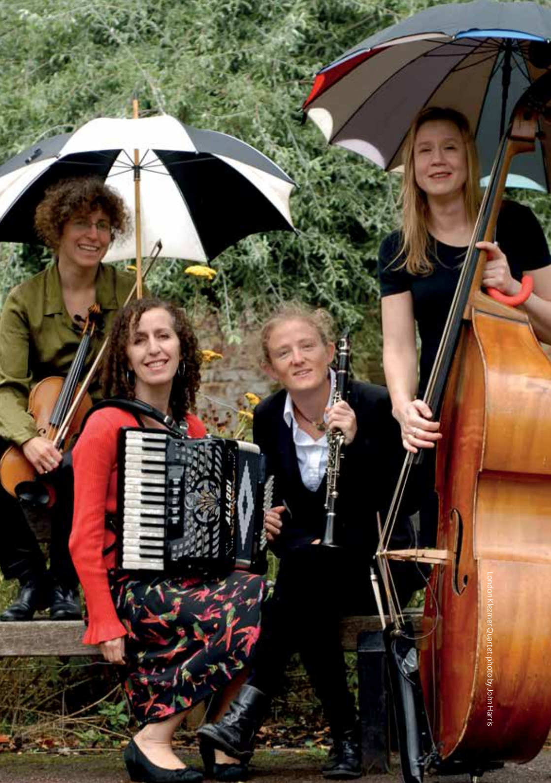
London Klezmer Quartet