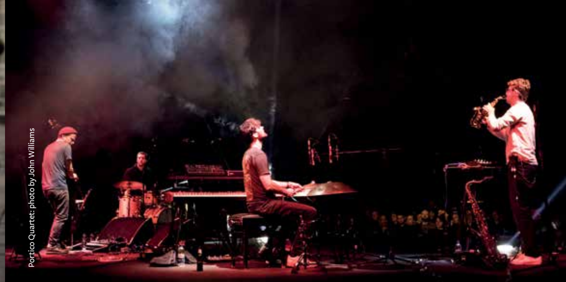
Portico Quartet

Presented by Southampton Classical Guitar Society in association with Turner Sims