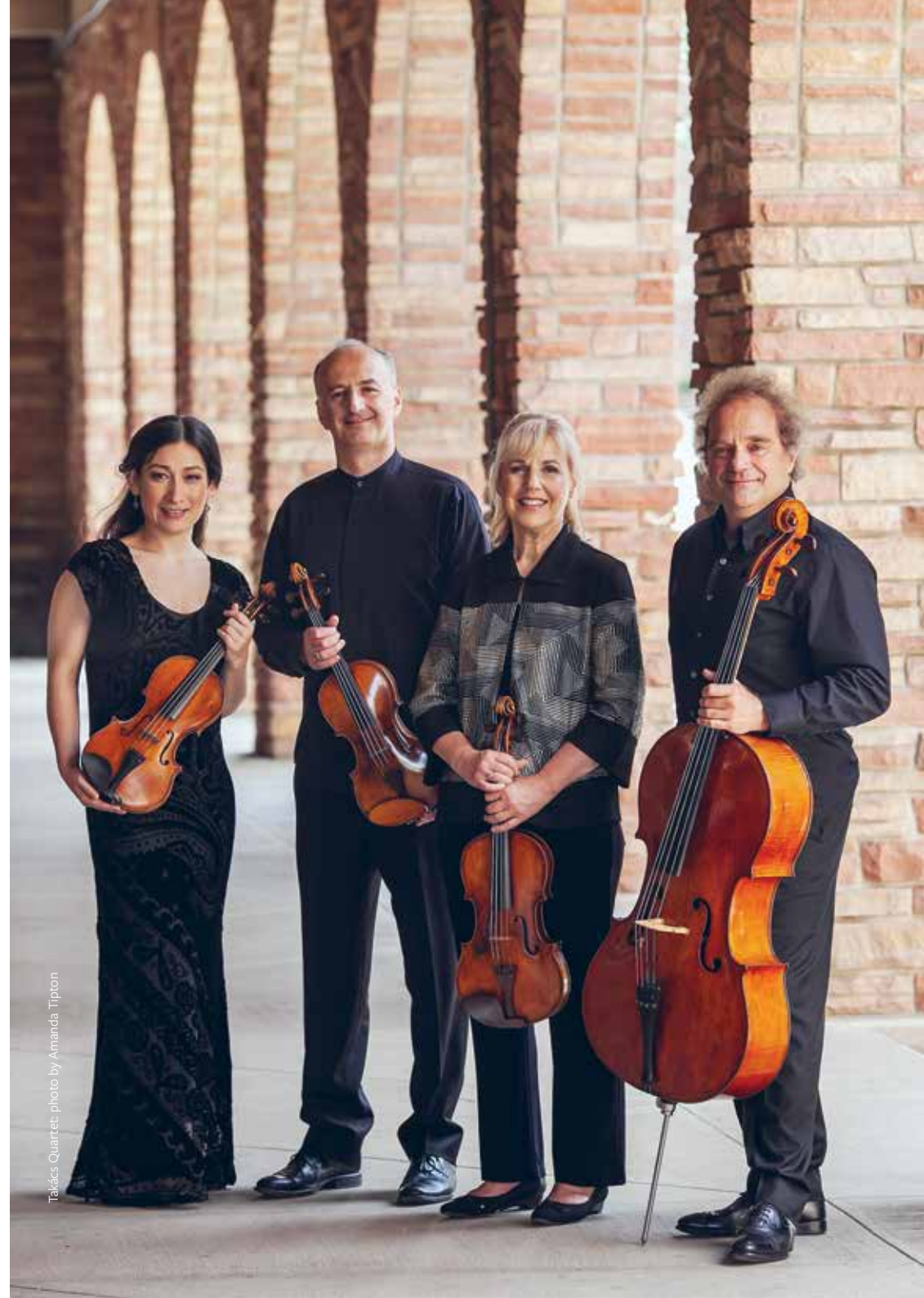
Takács Quartet