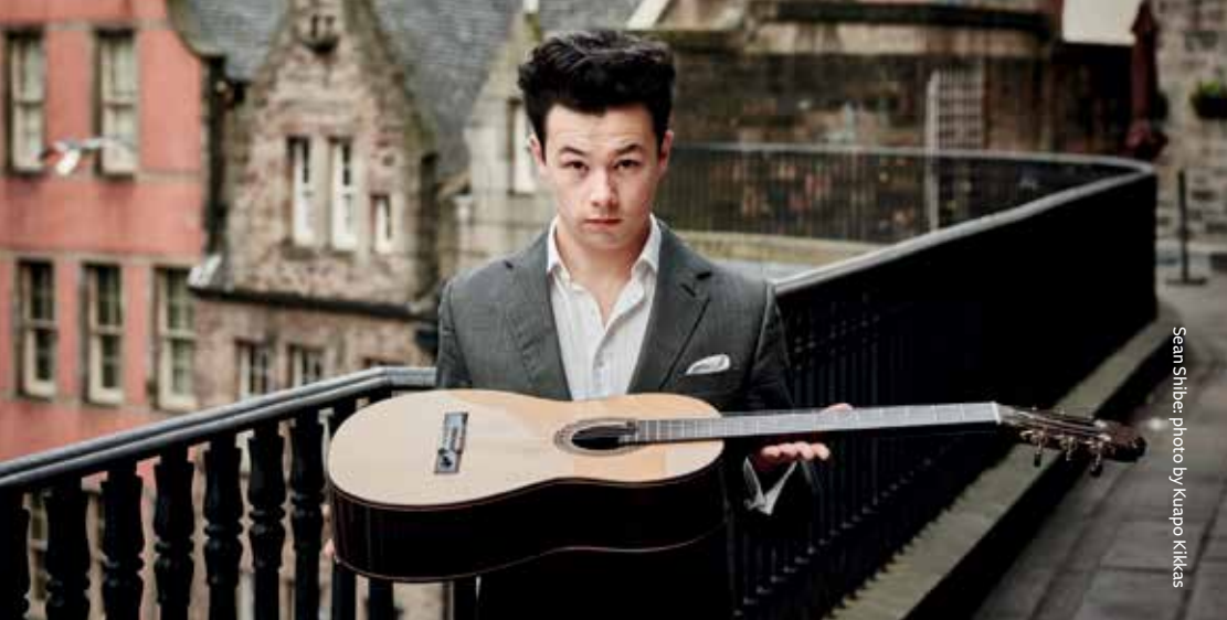
Sean Shibe: photo by Krappo Kikkas