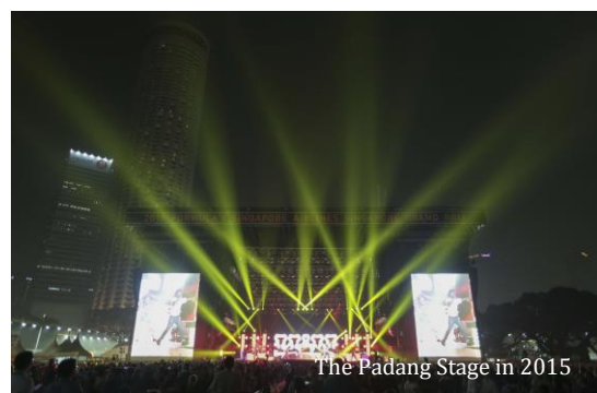
The Padang Stage in 2015

By positioning the Padang stage centrally, overall Fan Zone capacity will increase and will be split into six sections for easier and safer crowd control. "The front of house that controls spotlights and audio towers will be tucked in front of the heritage trees on Connaught Drive so we don't lose valuable viewing space behind the towers. Overall, the patrons furthest from stage will be much closer than in past years. We will also install additional superscreens on the far right and left of the stage to give a wider viewing opportunity for races and concerts which will take the concert experience all the way into the Esplanade Park," said Mr. Michael Roche, Executive Director of Singapore GP Pte Ltd.