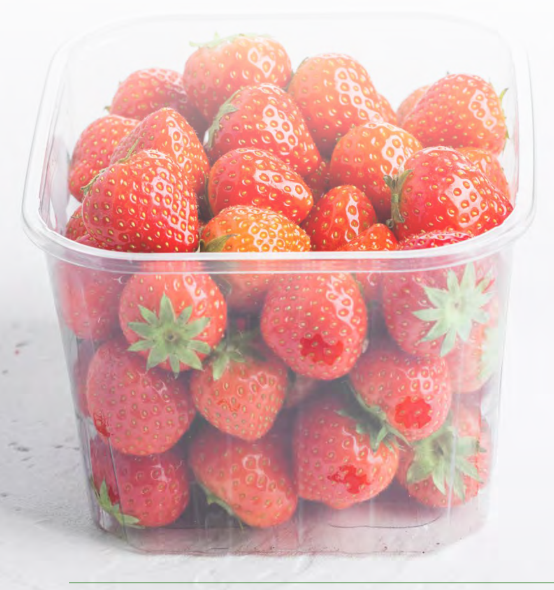
2 Although this study is on a packaging product not primarily used for take-away food, it might be assumed that similar materials and packaging types are used for take-away food and thus it was deemed relevant to include in the meta-analysis.