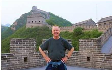
On the Great Wall - Badaling, China

"Nowadays, I very much enjoy reading and exercise including walks, hiking and biking. And our dog Finn, a feisty 20 lb. mutt, keeps me going on daily walks in the neighborhood. My wife and I still enjoy trips to the Sierras and occasional trips to other parts of the US as well as to other countries. We have enjoyed some great trips to such places as Beijing, China, Peru, Canada, and many parts of Europe. We truly enjoyed our walking tours in many of the cities we visited, as well as some very special places such as along the Great Wall, several cities in Andalusia, Spain, and around Machu Pichu. We also did a 20-mile bike ride along the Danube in Austria a few years ago.