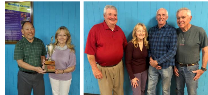
FALL SESSION – FINAL STANDING