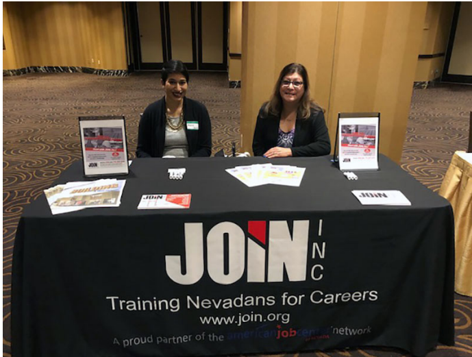
Job Opportunities in Nevada (JOIN) was one of several vendors representing assistance with employment, educational opportunities and financial literacy.