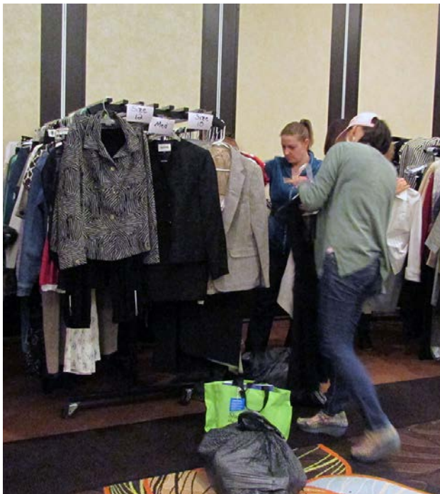
The event concludes with the popular Clothes Closet and shopping for work appropriate attire.