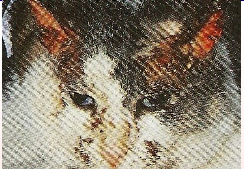
This cat suffers from pemphigus, an immune-compromising disease.