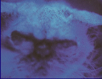
This cat is diagnosed with ringworm. The fluorescent coloring is the result of a Wood's lamp examination.