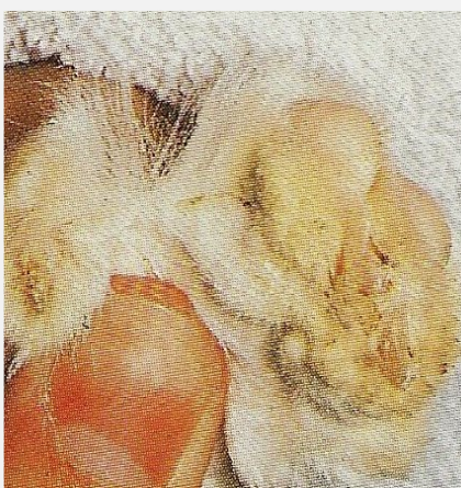
Sores can appear throughout the body including the foot pads.