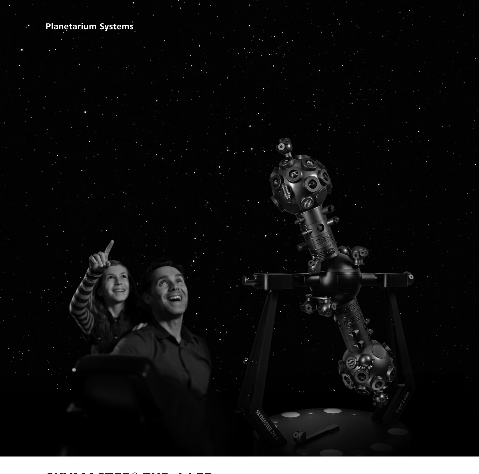
SKYMASTER® ZKP 4 LED – The Small Size Planetarium for the Digital Age