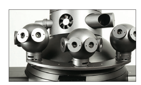
Projectors for zodiacal constellation figures, equator and ecliptic.

A convenient control panel with clearly arranged buttons and knobs, and the SKYPOST control program simplify working with the system despite the considerably expanded range of functions. SKYMASTER ZKP4 permits manual and fully automatic operation, as well as switching between live presentations and program-guided playback. The control system is so easy to use that you can even have students operating and programming the system.