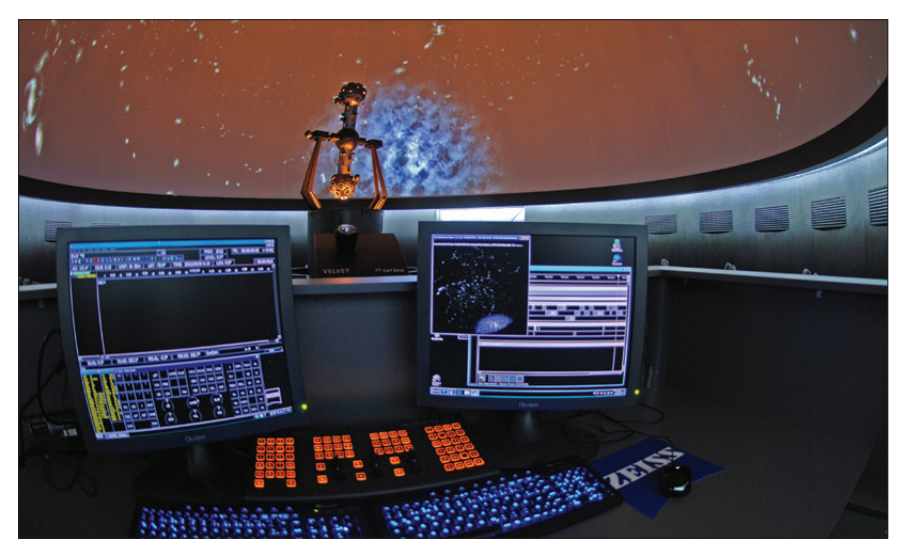
SKYMASTER VELVET in the Laupheim Planetarium.

The user interface provides clarity and flexibility. A new feature allows you to open several show programs at once. You can work with the timeline and list view at the same time, edit different positions in the show program and group control commands. The instrument status can be shown in digital and analog form for fast orientation during live presentations. All functions can be activated separately, i. e. independently of each other. SKYMASTER ZKP 4 LED also lets you link functions with each other in sensible combinations, for example to control a sunset.