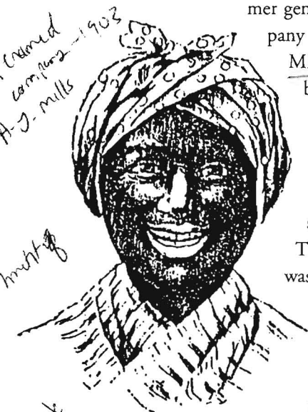
2. Inside cover, The Life of Aunt Jemima .