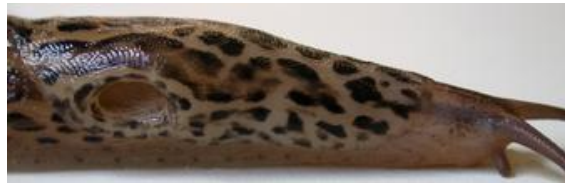
ADW Mollusca Pictures