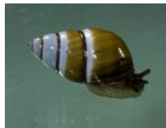
ADW Mollusca Pictures

5. Shell- an exoskeleton protecting the soft body