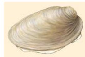
ADW Mollusca Pictures

Oyster makes pearls- sand is covered by a thin sheet of nachre