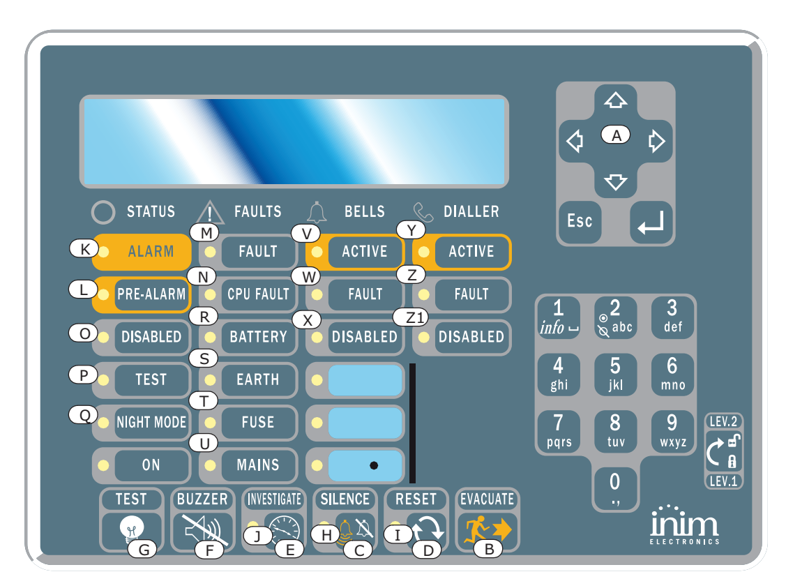
Figure 2 - Front view of the repeater panel

Connected repeater panels replicate all the information provided by the control panel and allow access to all Level 1 and 2 functions (View active events, Reset, Silence, etc.), but do not allow access to the Main menu.