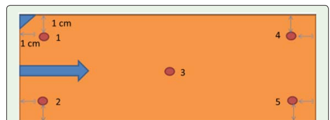
Figure 2: Fixed measuring locations on the graft.

For this validation study no formal sample size calculation was performed, but 50 skin grafts were assumed to be sufficient to draw conclusions on the reliability and validity of the thickness measurements.