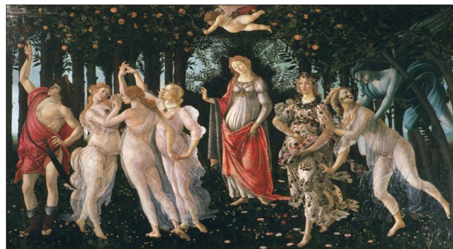
Primavera (Allegory of Spring) by Sandro Botticelli