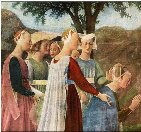
The Story of the True Cross by Piero della Francesca

Hotel il Chiostro (Breakfast, Lunch, Dinner)