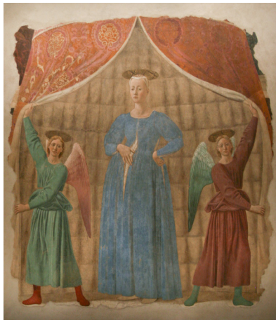
Madonna del Parto by Piero della Francesca