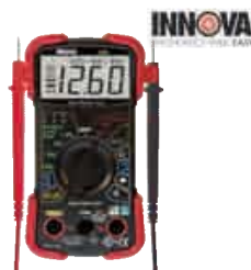
Auto Range Multimeter SKU 064472 3320 24 99