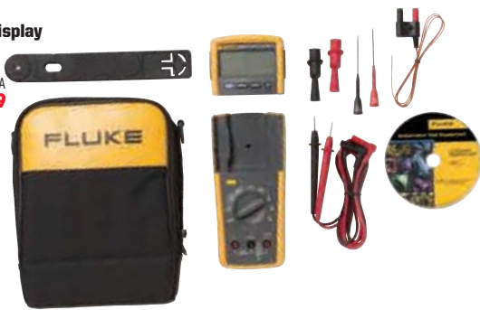
SKU 262526 FLUFLUKE233A 399 99