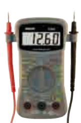
Digital Multimeter SKU 064471 3306N 14 99