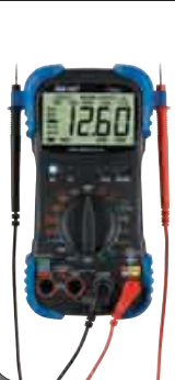
Automotive Digital Multimeter (10 Meg Ohm/UL) SKU 094874 INN3340 99 99