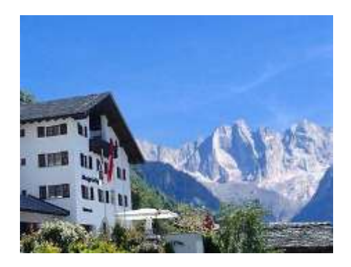
Hotel Andossi, Madesimo