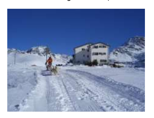
Mountain Restaurant Baitella