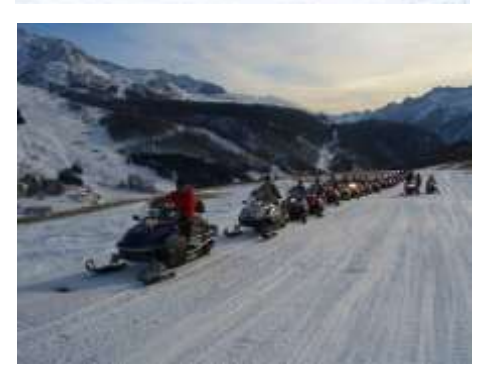
HB - Adventure Switzerland