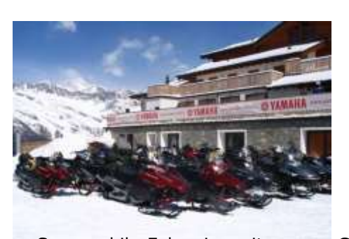
Snowmobile-Exkursion mit grosser Gruppe