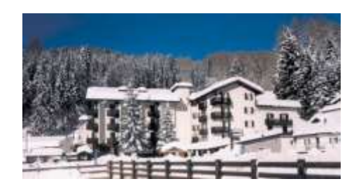
Our Snowmobile base, Madesimo