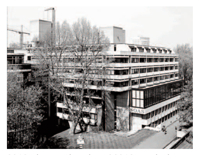
SOAS Library in Bloomsbury.

With SOAS Library designated as one of the five national research libraries in the U.K., it holds rare, historical collections that have international importance, including pre-1960 materials published in Asia and Africa, which are often unavailable even in the countries of origin. The Library's current mission statement is 'to provide high quality information services and resources to reflect and support the School's standing as a leading international Centre of excellence for the research, learning and teaching of Asia, the Middle East and Africa'. It serves scholars within and outside the School as well as the general public. On average about 8000 external users access the Library every year.