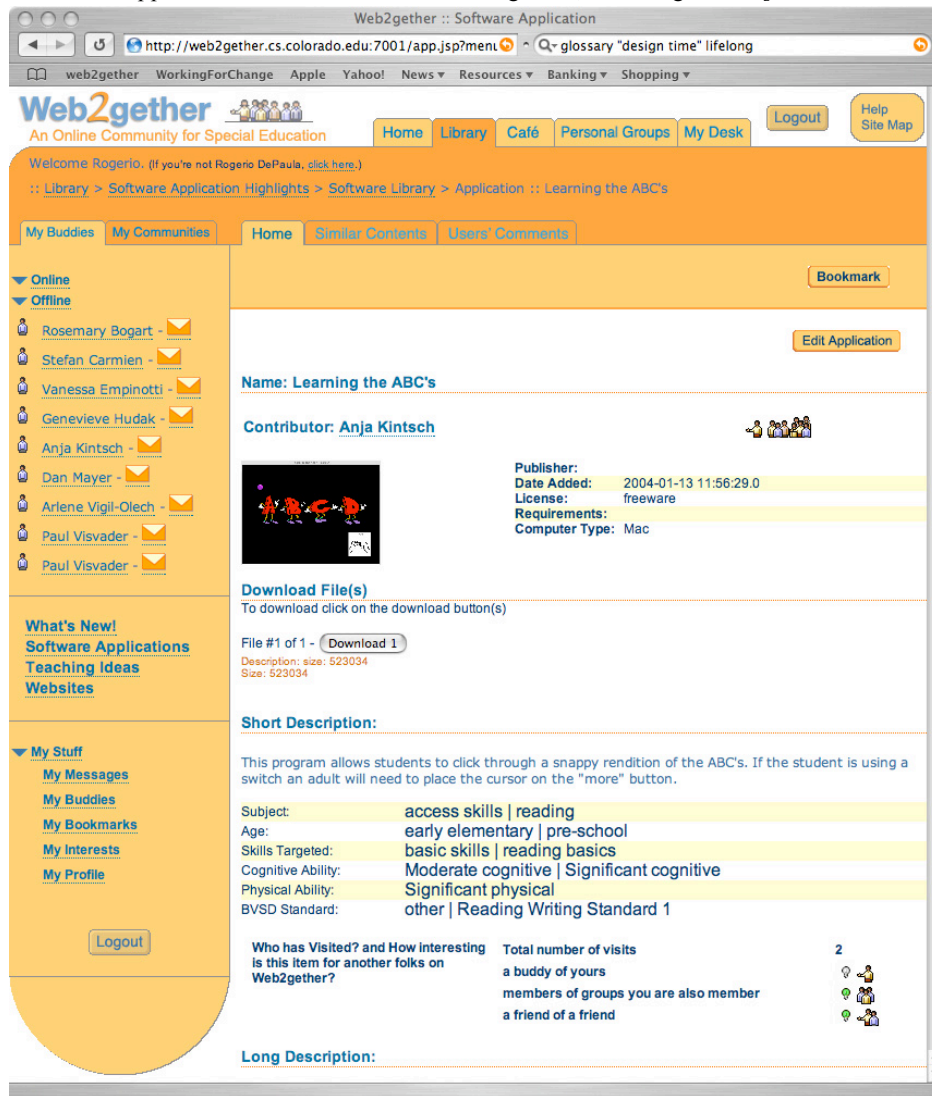
Figure 1: Web2gether Screen Image

distributed and complex work practices [Bobrow & Whalen, 2002]. It goes beyond the mere access model of technology [Arias et al., 1999] by supporting informed participation [Brown et al., 1994] based on the seeding, evolutionary growth, reseeding model [Fischer & Ostwald, 2002].