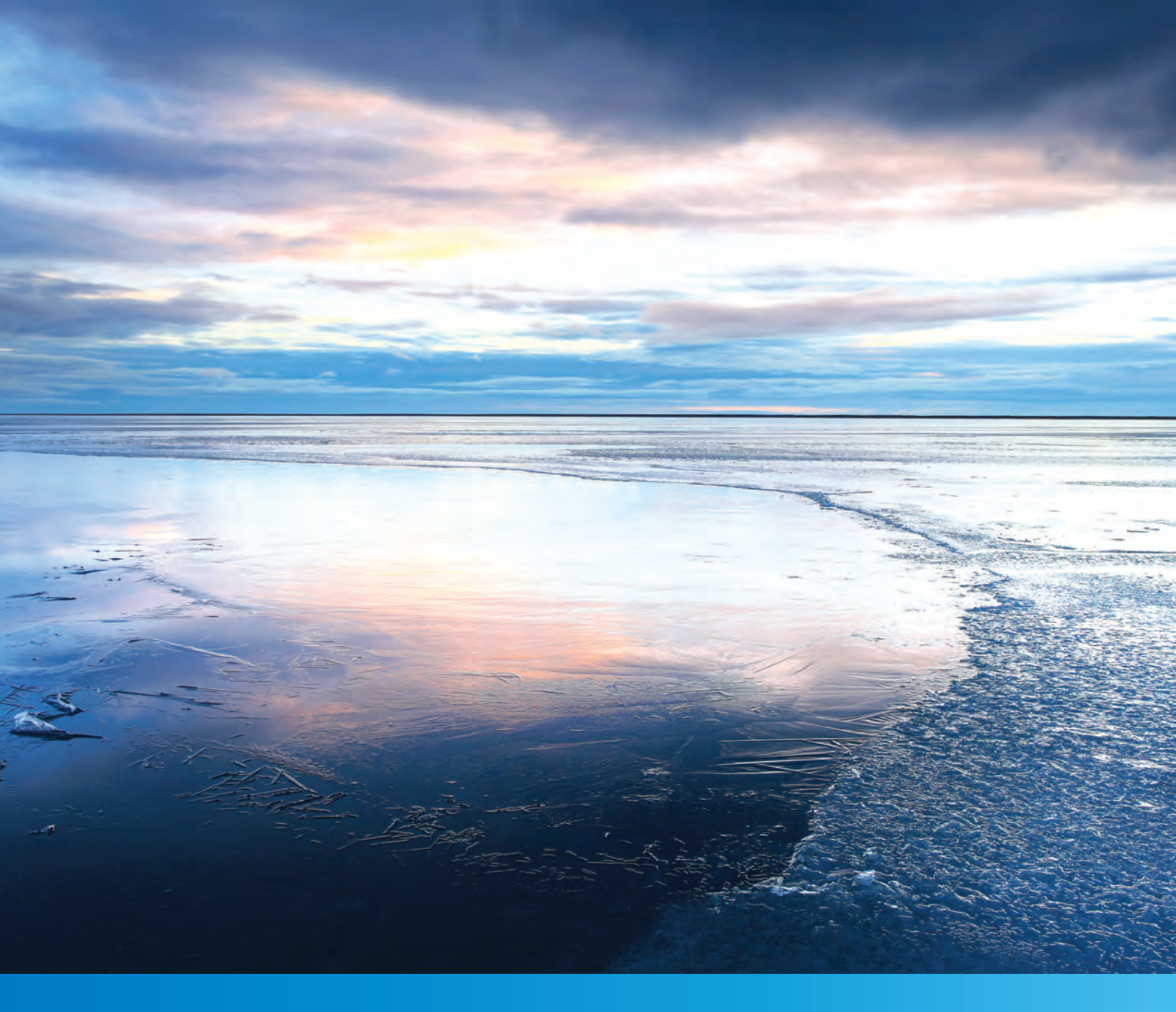
SOCIAL DETERMINANTS OF INUIT HEALTH IN CANADA