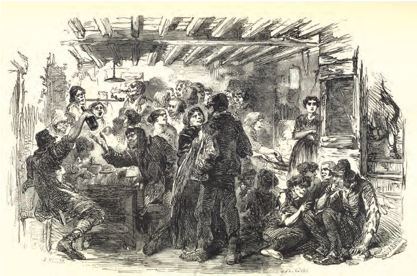
Fig. 1 – The London poor in the mid-nineteenth century as seen by a contemporary.

From: Henry Mayhew, London Labour and the London Poor, 1861.