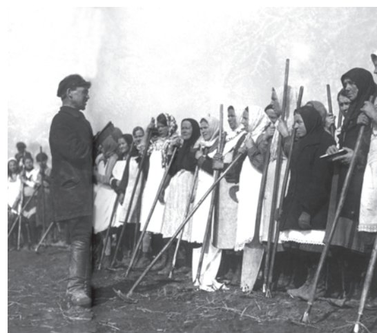
Fig. 19 – Peasant women being gathered to work in the large collective farms.