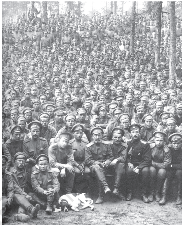
Fig. 7 – Russian soldiers during the First World War.

The war also had a severe impact on industry. Russia’s own industries were few in number and the country was cut off from other suppliers of industrial goods by German control of the Baltic Sea. Industrial equipment disintegrated more rapidly in Russia than elsewhere in Europe. By 1916, railway lines began to break down. Able-bodied men were called up to the war. As a result, there were labour shortages and small workshops producing essentials were shut down. Large supplies of grain were sent to feed the army. For the people in the cities, bread and flour became scarce. By the winter of 1916, riots at bread shops were common.