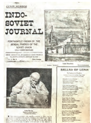
Fig.20 – Special Issue on Lenin of the Indo-Soviet Journal. Indian communists mobilised support for the USSR during the Second World War.