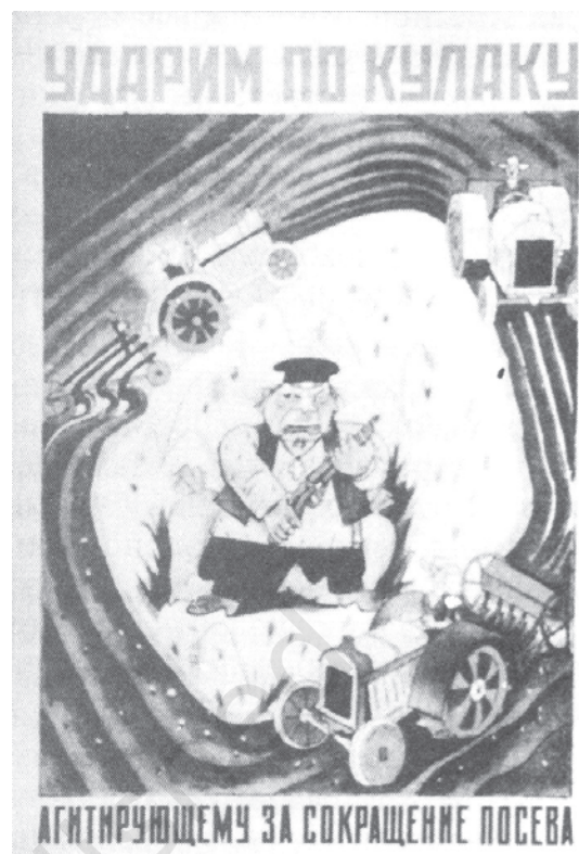
Fig. 18 – A poster during collectivisation. It states: ‘We shall strike at the kulak working for the decrease in cultivation.’

Exiled – Forced to live away from one’s own country.