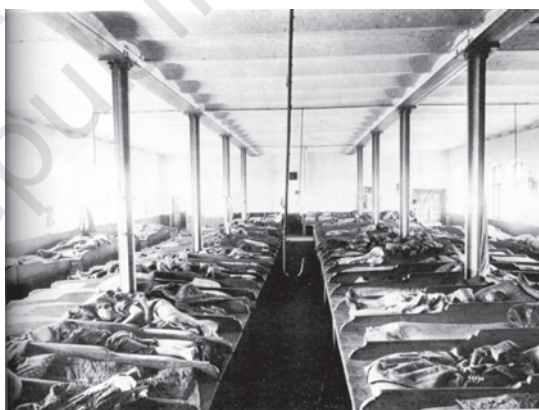
Fig.6 – Workers sleeping in bunkers in a dormitory in pre-revolutionary Russia.

Many survived by eating at charitable kitchens and living in poorhouses.