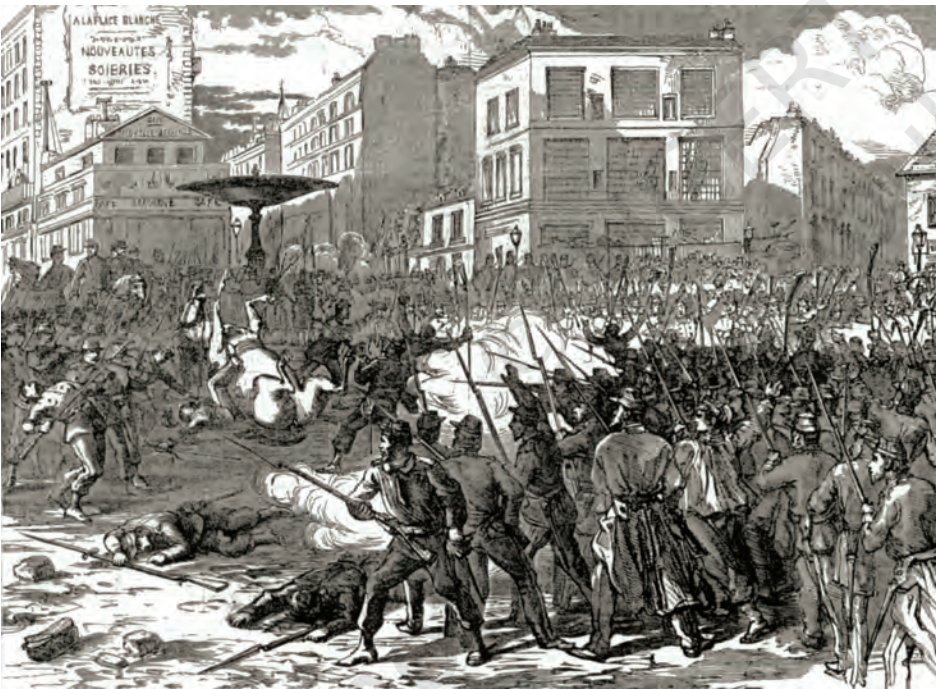
Fig.2 – This is a painting of the Paris Commune of 1871 (From Illustrated London News, 1871). It portrays a scene from the popular uprising in Paris between March and May 1871. This was a period when the town council (commune) of Paris was taken over by a ‘peoples’ government’ consisting of workers, ordinary people, professionals, political activists and others. The uprising emerged against a background of growing discontent against the policies of the French state. The ‘Paris Commune’ was ultimately crushed by government troops but it was celebrated by Socialists the world over as a prelude to a socialist revolution. The Paris Commune is also popularly remembered for two important legacies: one, for its association with the workers’ red flag – that was the flag adopted by the communards ( revolutionaries) in Paris; two, for the ‘Marseillaise’, originally written as a war song in 1792, it became a symbol of the Commune and of the struggle for liberty.