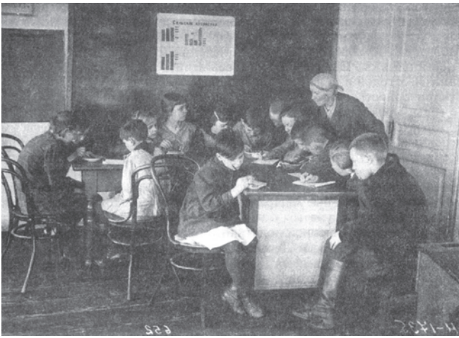
Fig. 15 – Children at school in Soviet Russia in the 1930s. They are studying the Soviet economy.