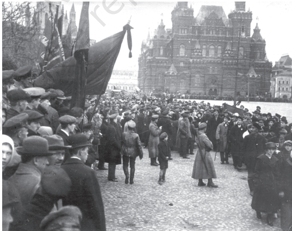
Fig. 13 – May Day demonstration in Moscow in 1918.