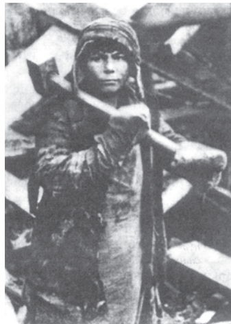
Fig. 16 – A child in Magnitogorsk during the First Five Year Plan. He is working for Soviet Russia.