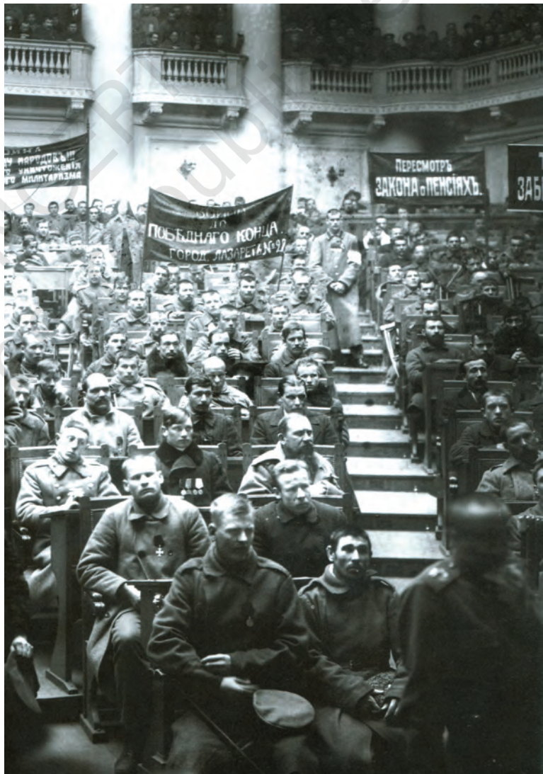
Fig. 8 – The Petrograd Soviet meeting in the Duma, February 1917.

On Sunday, 25 February, the government suspended the Duma. Politicians spoke out against the measure. Demonstrators returned in force to the streets of the left bank on the 26th. On the 27th, the Police Headquarters were ransacked. The streets thronged with people raising slogans about bread, wages, better hours and democracy. The government tried to control the situation and called out the cavalry once again. However, the cavalry refused to fire on the demonstrators. An officer was shot at the barracks of a regiment and three other regiments mutinied, voting to join the striking workers. By that evening, soldiers and