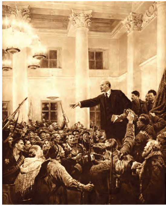
Fig.9 – A Bolshevik image of Lenin addressing workers in April 1917.

Meanwhile in the countryside, peasants and their Socialist Revolutionary leaders pressed for a redistribution of land. Land committees were formed to handle this. Encouraged by the Socialist Revolutionaries, peasants seized land between July and September 1917.