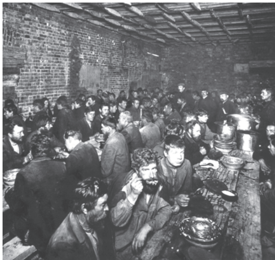
Fig.5 – Unemployed peasants in pre-war St Petersburg.

In the countryside, peasants cultivated most of the land. But the nobility, the crown and the Orthodox Church owned large properties. Like workers, peasants too were divided. They were also