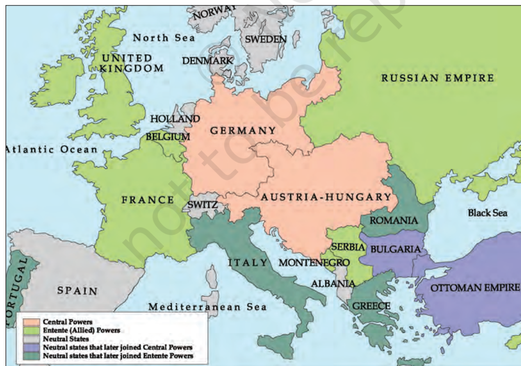
Fig.4 – Europe in 1914.

The map shows the Russian empire and the European countries at war during the First World War.