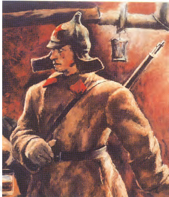
Fig. 12 – A soldier wearing the Soviet hat (budeonovka).

The Bolshevik Party was renamed the Russian Communist Party (Bolshevik). In November 1917, the Bolsheviks conducted the elections to the Constituent Assembly, but they failed to gain majority support. In January 1918, the Assembly rejected Bolshevik measures and Lenin dismissed the Assembly. He thought the All Russian Congress of Soviets was more democratic than an assembly elected in uncertain conditions. In March 1918, despite opposition by their political allies, the Bolsheviks made peace with Germany at Brest Litovsk. In the years that followed, the Bolsheviks became the only party to participate in the elections to the All Russian Congress of Soviets, which became the Parliament of the country. Russia became a one-party state. Trade unions were kept under party control. The secret police (called the Cheka first, and later OGPU and NKVD) punished those who criticised the Bolsheviks. Many young writers and artists rallied to the Party because it stood for socialism and for change. After October 1917, this led to experiments in the arts and architecture. But many became disillusioned because of the censorship the Party encouraged.