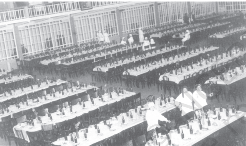
Fig. 17 – Factory dining hall in the 1930s.