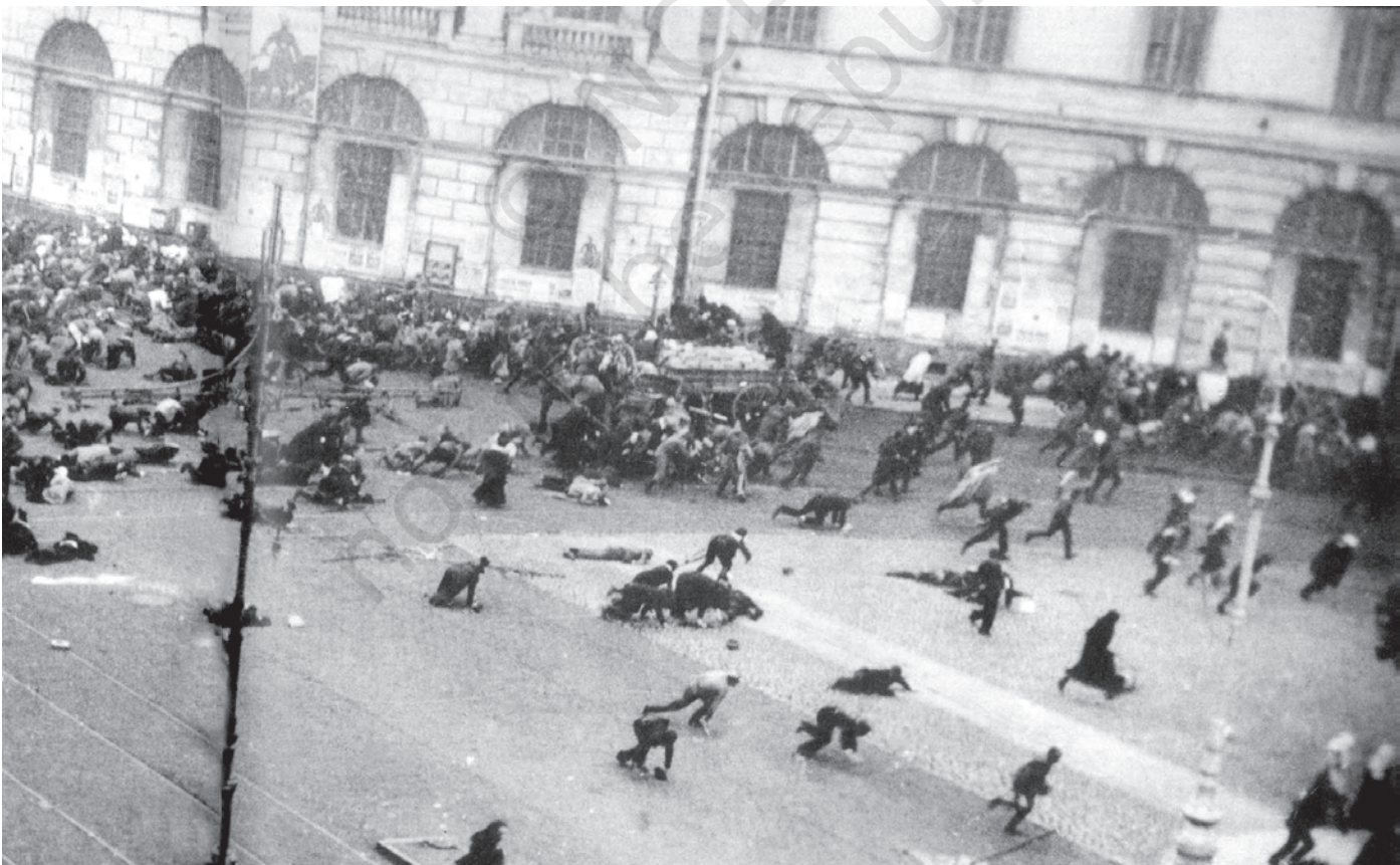
Fig.10 – The July Days. A pro-Bolshevik demonstration on 17 July 1917 being fired upon by the army.