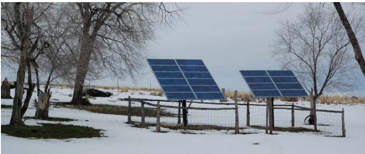
http://bit.ly/2b2051H • Jim Kelly

Still a bit perplexed about how to conduct a financial analysis on a proposed PV project? Please contact a local extension office.